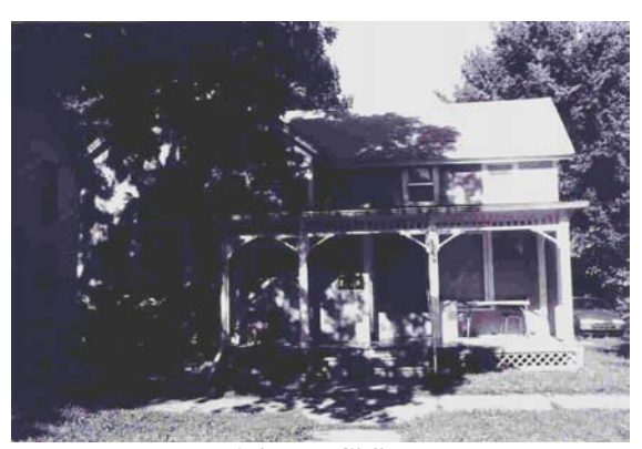
Asbestos Siding, 1032 Rhode Island Street (Photo # 106)