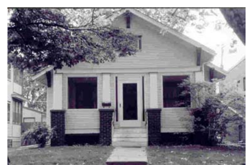
Porch Infill, 1025 Rhode Island Street, Looking West (Photo # 3)