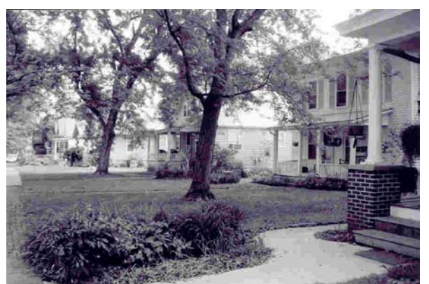
Variances in Setbacks, Looking North from 922 Rhode Island Street (east side of 900 Block, Photo # 35)

numbered streets at the ends of blocks. Six historic houses (702, 732, 917, 923, 1007, and 1017 Rhode Island Street) occupy double lots or one-and-one-half lots. The extra lot width is typical of older neighborhoods where residents occasionally purchased an extra lot with neighbors to provide side yards for gardens or green space (Photo # 36). The nonhistoric apartment building at 1021 Rhode Island occupies a double lot.