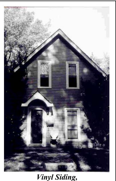
Vinyl Siding, 910 Rhode Island Street (Photo # 113)

include 910 , 1028 and 1032 Rhode Island Street. These houses, in particular, would be considered contributing if the siding were removed (Photo #s 113, 105, 106).