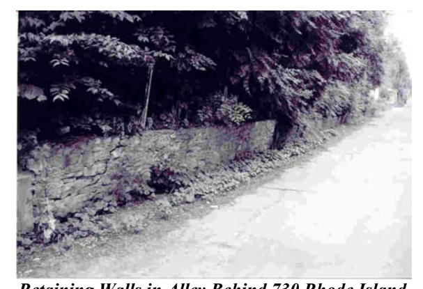
Retaining Walls in Alley Behind 730 Rhode Island Street (Photo # 10)

Sited to face the street, the district's residences occupy the narrow city lots delineated in the original townsite plan. Six houses face the