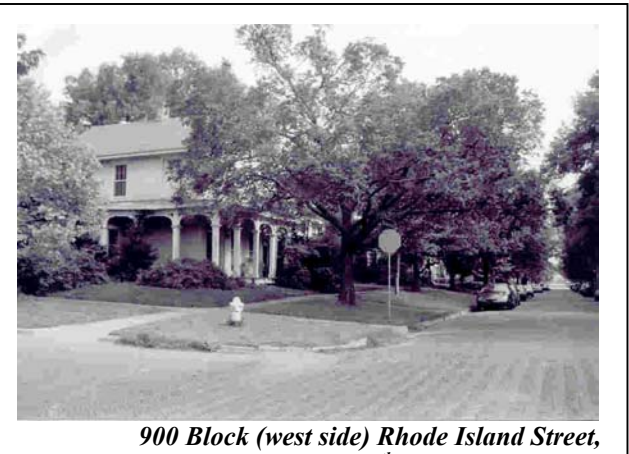
900 Block (west side) Rhode Island Street, Looking North from 10<sup>th</sup> Street (Photo #30)

The district's cohesive streetscapes create a distinct sense of neighborhood and a strong residential boundary, contrasting dramatically with the commercial area to the west. Asphalt paves most of Rhode Island Street, although original brick pavement is exposed on the 900 and 1200 blocks. The difference in street level between the blocks with a brick street surface and those with an asphalt street surface is perceptible. The sections of brick street reveal the original street depth, which, when compared to the siting of the adjacent houses, emphasizes the role of the street as a drainage system.