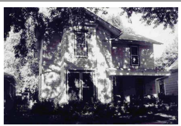
Asbestos Siding, 1028 Rhode Island (Photo # 105)