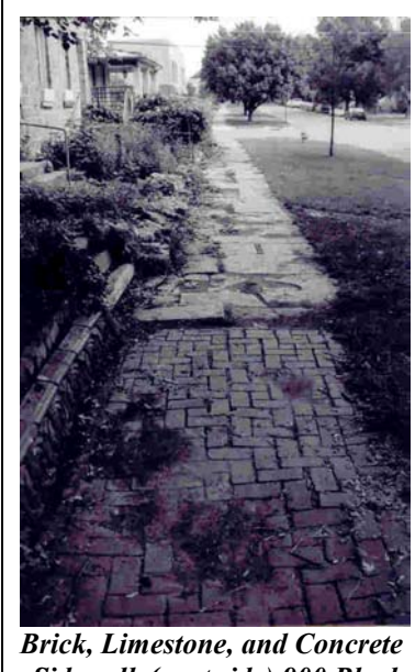
Brick, Limestone, and Concrete Sidewalk (west side) 900 Block Rhode Island Street (Photo #27)

with mature shade trees separate the streets from the sidewalks, creating a smooth transition between public and private spaces (Photo numbers 17, 30).