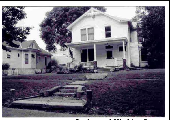
Setting and Hitching Posts, 923 Rhode Island Street (Photo # 36)

Houses are typically situated near the center of their lots, which enhances the cohesiveness and rhythm of the district. However, the early construction of many houses and the undulating terrain often resulted in uneven setbacks from the street line. This is particularly notable along the 700 block of