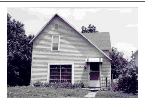
Inappropriate Porch and Window Alterations, 826 Rhode Island Street (Photo # 81)