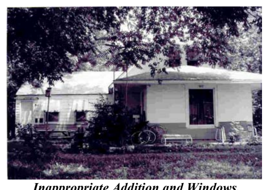
Inappropriate Addition and Windows, 822 Rhode Island Street (Photo # 80)

Other non-historic alterations in the district include inappropriate remodeling, new additions, and/or porch replacements, such as those evident at 822 and 826 Rhode Island Street . Vinyl siding and new windows have significantly compromised the integrity of 1000 Rhode Island Street . Porch infill has substantially changed the look and feel of the Bungalow at 1025 Rhode Island Street (Photo #s 80, 81, 6, 3).