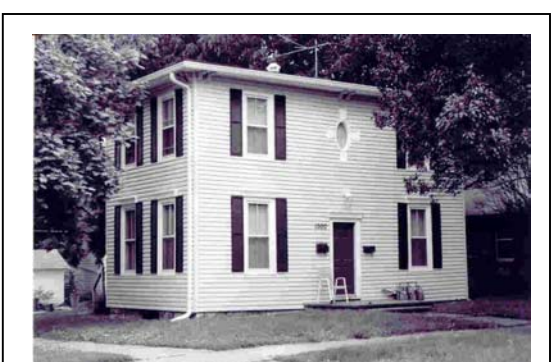
Vinyl Siding and Inappropriate Window Replacement, 1000 Rhode Island Street (Photo # 6)