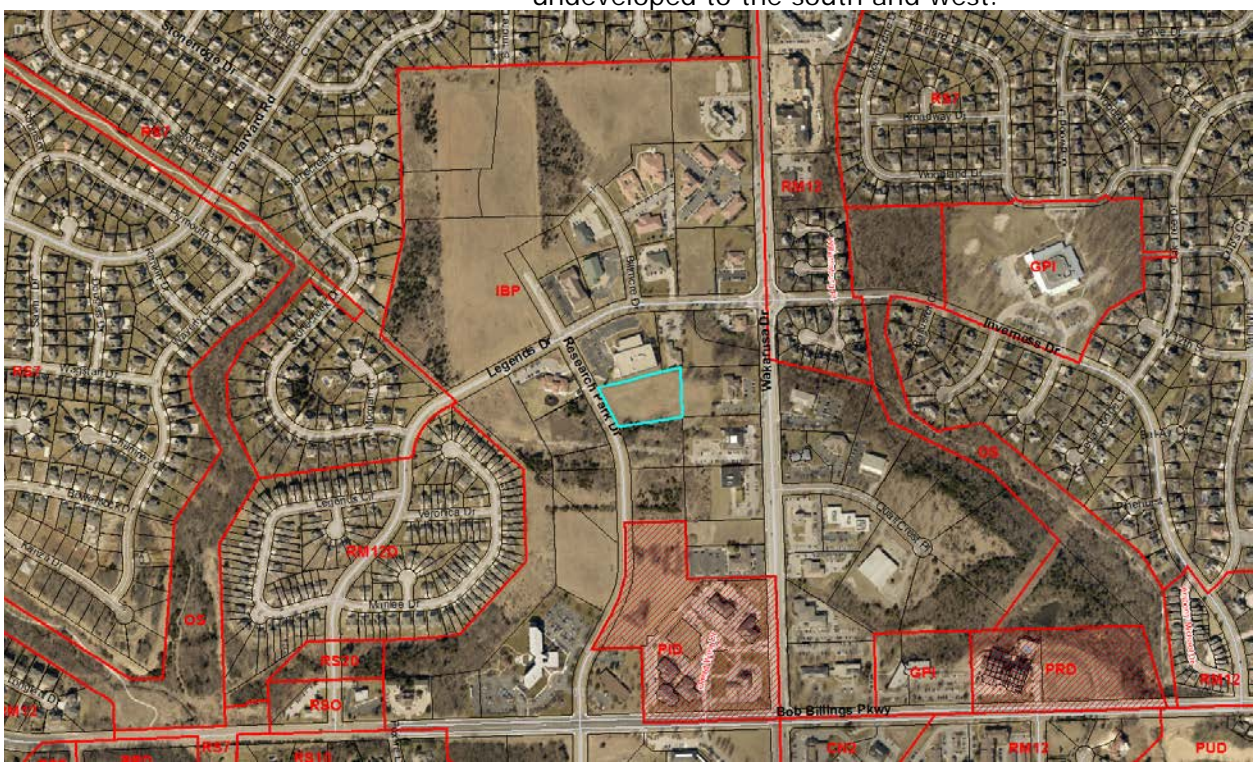
Figure 1 : Surrounding zoning and land use of the subject property.

IBP (Industrial/Business Park) District in all directions; Day Care Center to the northwest, Manufacturing and Production, Limited and Office to the north, Health Care Office, Health Care Clinic to the east and southeast, undeveloped to the south and west.