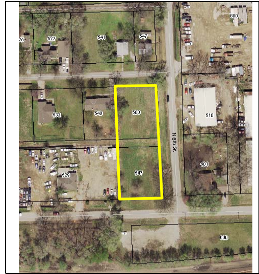
Figure 1. Zoning Exhibit. Subject property outlined.

This project includes the rezoning of approximately .6 acres located on the west side of N. 6 th Street between Maple Street and Perry Street. The property is being rezoned and replatted to accommodate the development of a City Stormwater Pump Station, which is a Minor Utility . As the minor utility will serve more than one subdivision approval of a Special Use Permit is required.