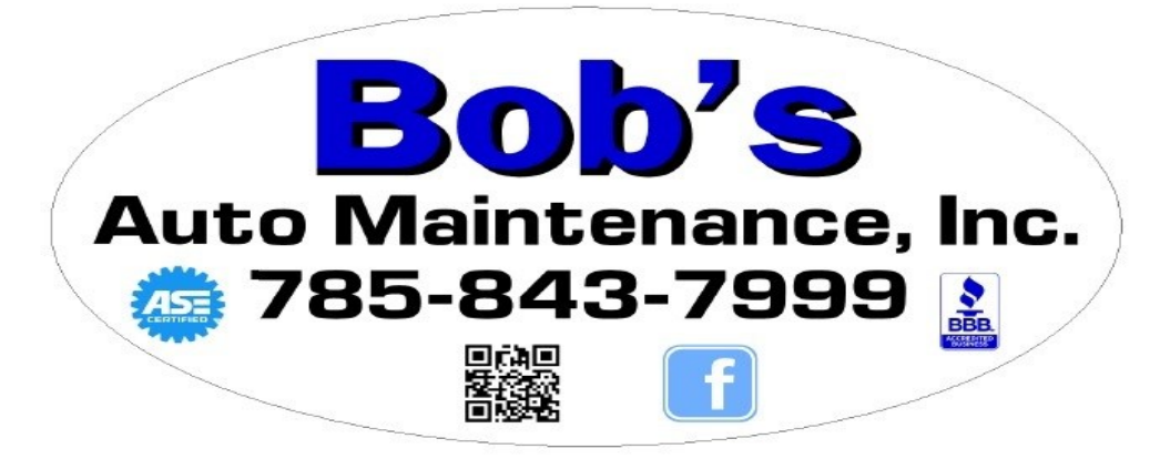
20% discount for North Lawrence residents (excluding tires & batteries)