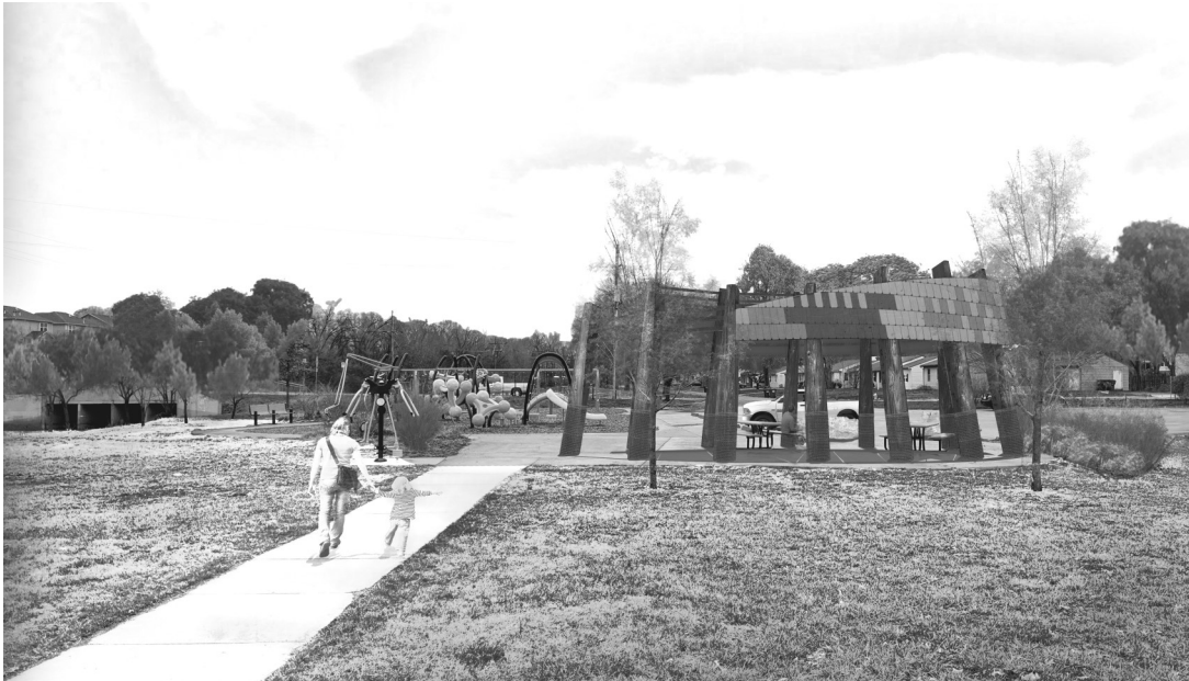
Artistic rendering of the Prairie Block shade structure at Burroughs Creek Park, designed by KU students, with the assistance of neighbors and Prairie Block folks.

For details about the schedule, activities, and partners, check the Prairie Block Facebook page at https://www.facebook.com/Prairie-Block-328644767744798 . See you there!