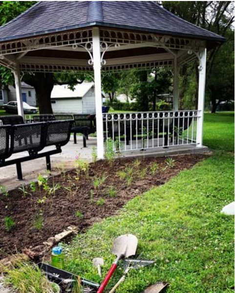
New native garden planted at Brook Creek Park gazebo by Brook Creek, Grassland Heritage Foundation, and Kaw Valley Native Plant Coalition.