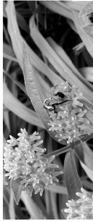
Bumblebee on butterfly milkweed

caterpillars on flowering milkweed plants. The Monarch Watch plant sale and open house is on May 7 at Foley Hall on KU west campus. The Grassland Heritage Foundation native plant sale is May 14 at the Lawrence Public Library lawn.