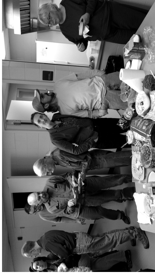
Neighbors gathered in December 2015 for annual officer elections and the Brook Creek holiday party.