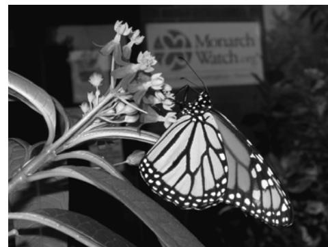
Monarch butterfly

Also, parsley and dill are easy to grow. Both plants support black swallowtail butterflies.