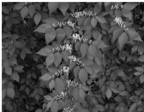
Amur Honeysuckle bush

grows 15-20 feet tall flowers in May fruit sets in August fruit ripe November