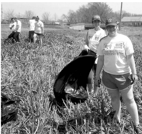
Volunteers from KU's Hashinger Hall at the April 2014 Brook Creek Park cleanup

Brook Creekers delivered cookies and snacks to the volunteers' floor of Hashinger Hall shortly before finals to thank them for their hard work.