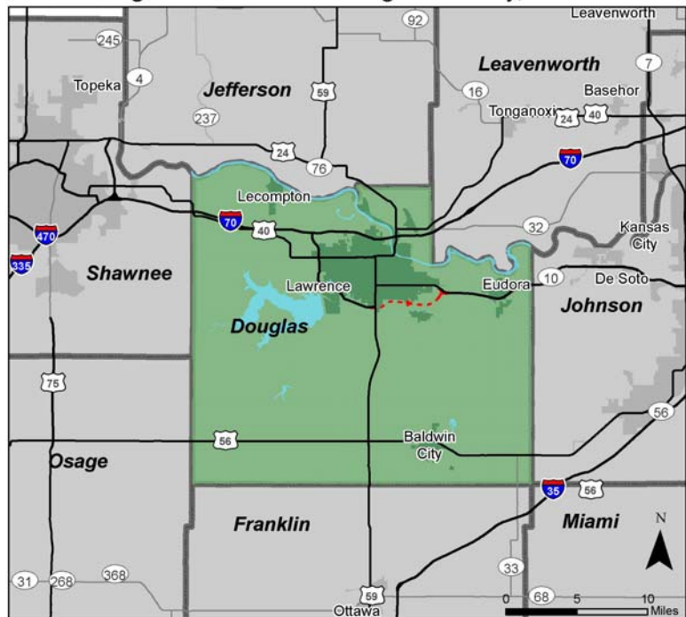
Regional Context of Douglas County, Kansas

The UPWP identifies and budgets the MPO’s transportation planning activities and projects for the 2017 fiscal year. This UPWP was developed in cooperation with the Kansas Department of Transportation (KDOT), the Federal Highway Administration (FHWA), the Federal Transit Administration (FTA), and other regional planning partners.