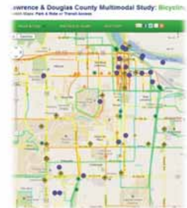
Online Interactive Mapping