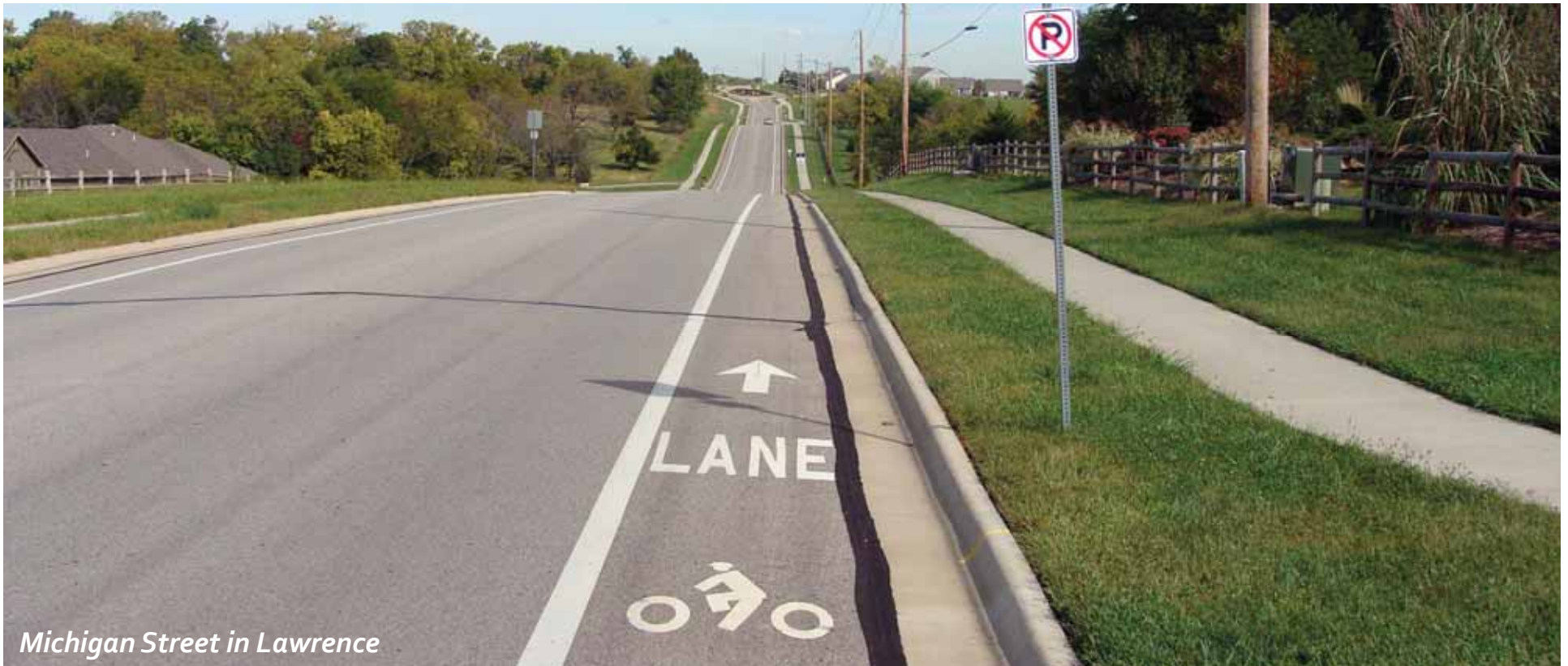
Michigan Street in Lawrence