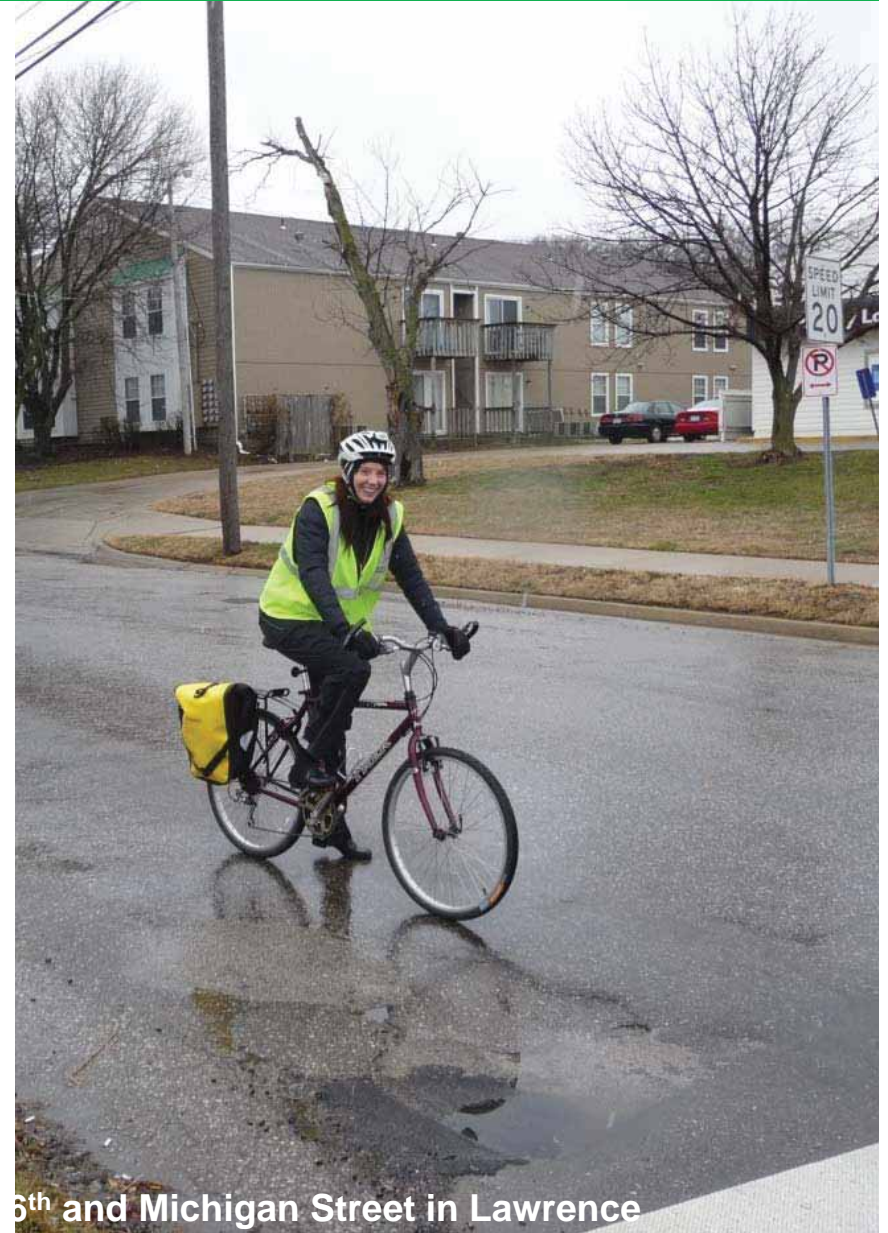
6 th and Michigan Street in Lawrence