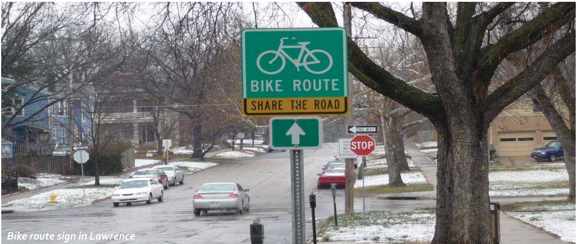
Bike route sign in Lawrence