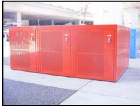
Bike to Work Bicycle Locker