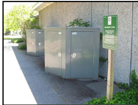
Bike Gard Bicycle Locker