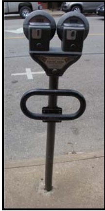
Parking Meter Ovals