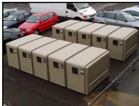
Cycle Works Bicycle Locker