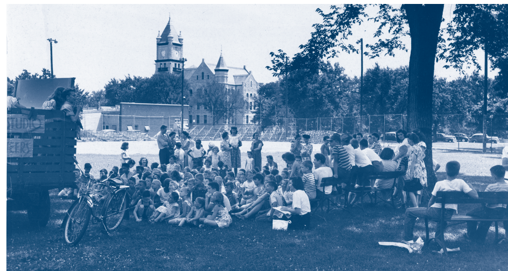
From then to now: South Park in Downtown Lawrence has long been a hub for Parks & Recreation.