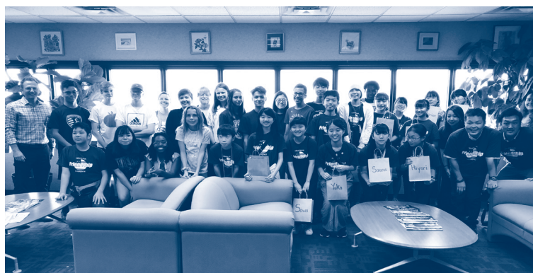
Students from Hiratsuka, Japan visit City Hall as part of their visit to Lawrence in July 2019. This is the 29th year of the Sister Cities exchange program with Hiratsuka.

More information on the Sister Cities program is available on the City of Lawrence website: lawrenceks.org/boards/sister-cities