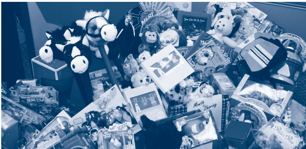
A collection of toys donated during the 2018 Month of Sharing event hosted by Lawrence Parks & Recreation.