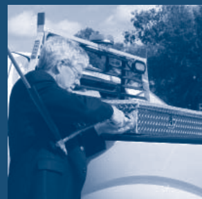
Mayor Robert Schumm fills a city truck with compressed natural gas - an energy efficient alternative fuel source.

Sustainability is a city priority but creating a healthy environment, economy, and society is a community-wide effort. Want to learn how you can help create a more sustainable Lawrence? Visit our website at www.lawrenceks.org/sustainability . Additionally, the city provides multiple programs and opportunities for residents to save energy, save water, recycle, bike to work, enjoy the outdoors, build a rain barrel and more!