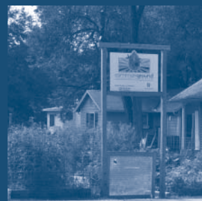
The Pennsylvania Street Community Garden at 1313 Pennsylvania was one of four Common Ground sites established in 2012.