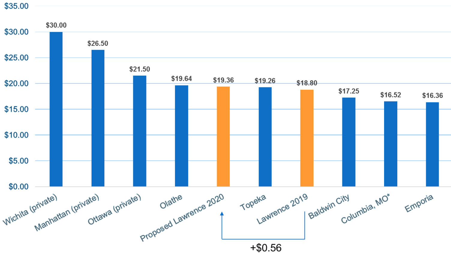
Monthly rates for Residential Trash and Recycling Service