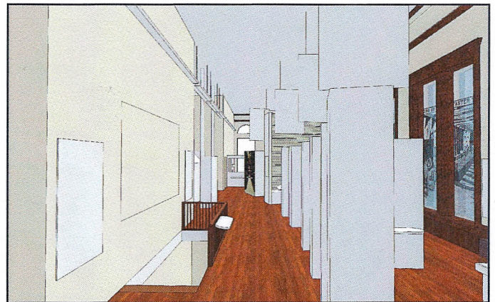
Third Floor, looking east