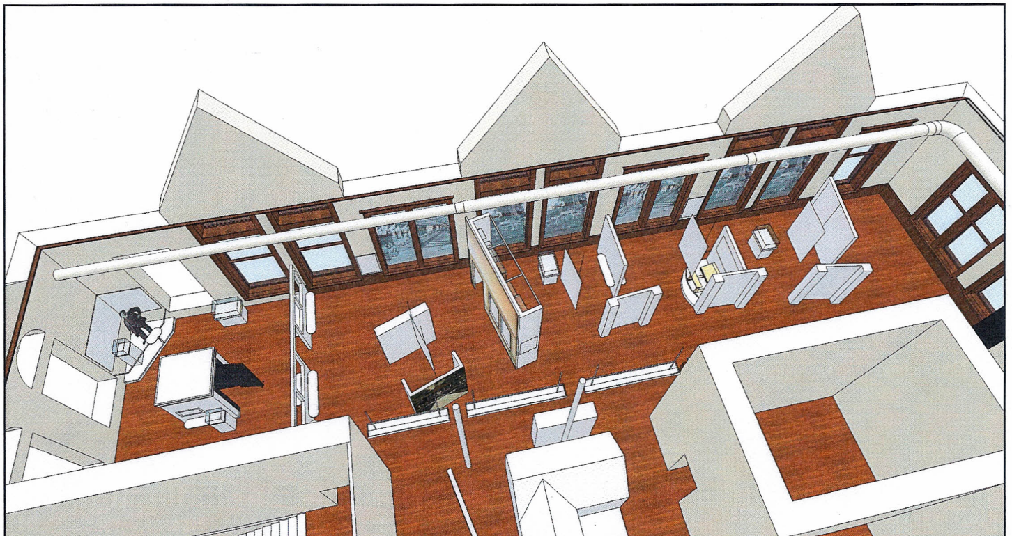
Third Floor, overview