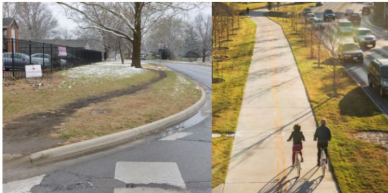
existing goat path