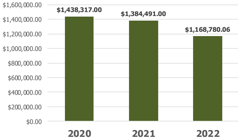
Annual City Revenue 2020 - 2022