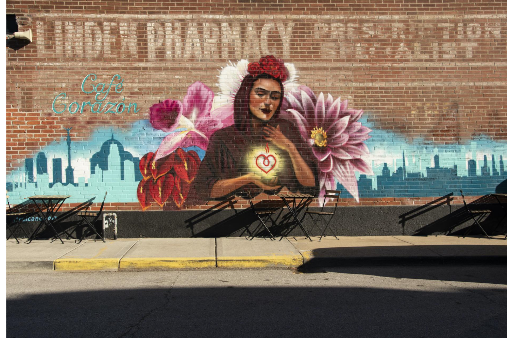
“Cafe Corazon” 2019. Kansas City, MO.

The Café Corazón mural is an homage to the beauty, color, and the arresting passion of Latinx culture. It stands for the strength of the people from all the different Latin countries that have found their way to Kansas City and made it home. It represents the heart of the Latin culture that beats on no matter where it finds itself. It is a celebration of community.