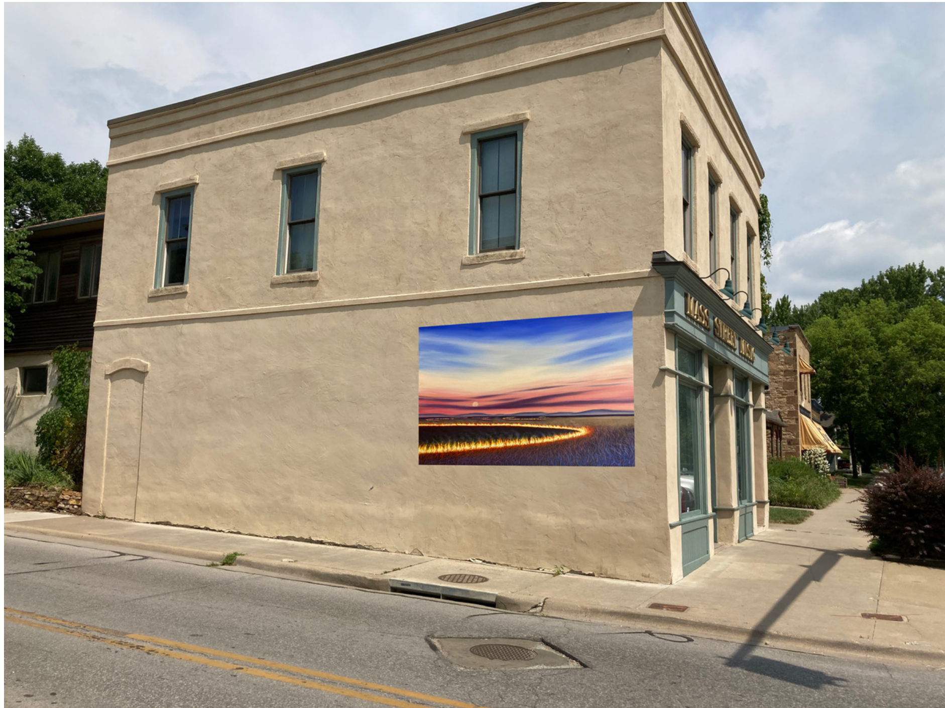
The mural will be approximately 8' x 12'