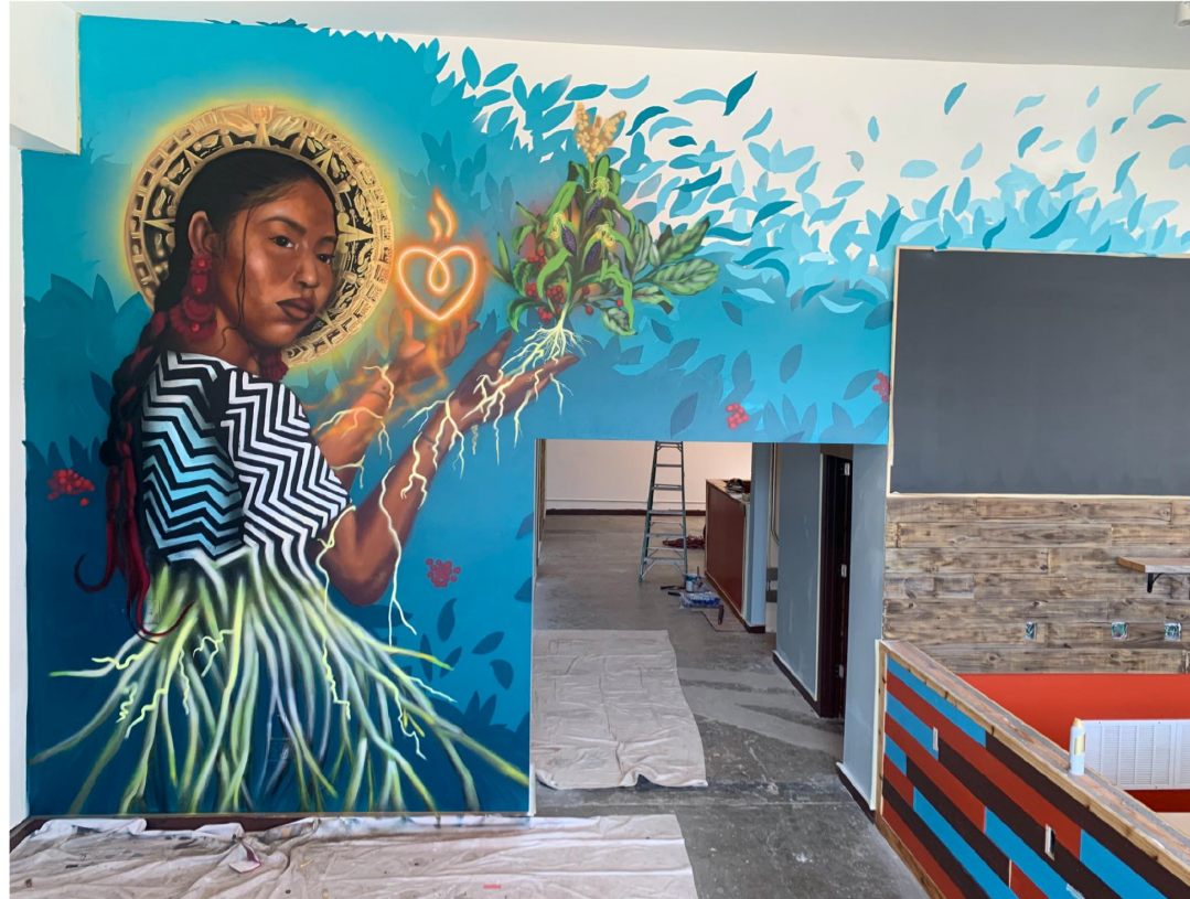
“Raices/Roots” 2021. Cafe Corazon 2, Kansas City, MO.

This work, completed for a Latinx owned coffee shop in Kansas City, honors the Indigenous roots of coffee, mate, and blue corn. The mural reminds viewers that these plants are gifts from Indigenous populations, and that their origins should never be forgotten. Behind the woman's head is an Aztec calendar, which represents the passage of time, eternity and continuity. The mural is an homage to the divinity found in reconnecting with nature and your cultural roots.