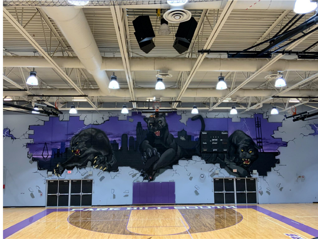
“Panther Pride” 2021. Park Hill South High School, Kansas City, MO.

This mural was designed and commissioned by the Park Hill School District to represent the school's mascot and shine as a symbol of pride for the members of the Park Hill South community. The Mural features a Kansas City background that celebrates hometown pride. The panthers in the mural direct their gaze towards the visitors side, maintaining a menacing stare to the opponents. As the main gym, this is where sports teams host all of their home games and major school events.