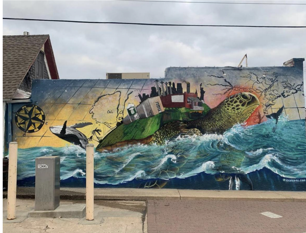
Aerosol on Brick wall Approx. 450 Sq. Ft.