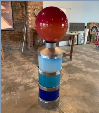
Glass tower model in studio