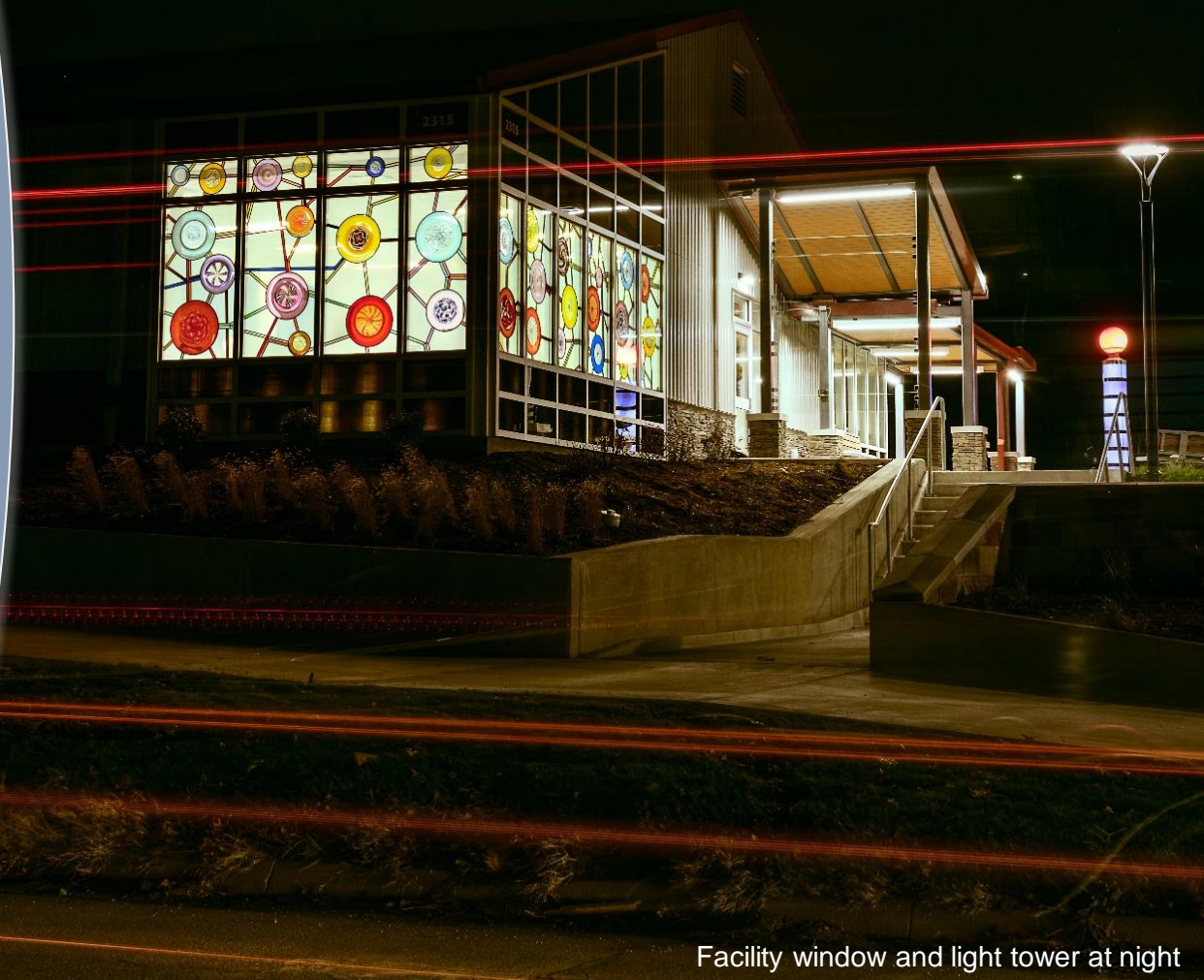
Facility window and light tower at night