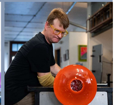
City of Lawrence, KS public art program