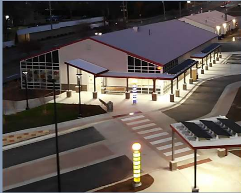
Drone image of new facility