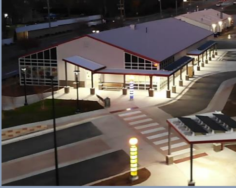
Drone image of new facility