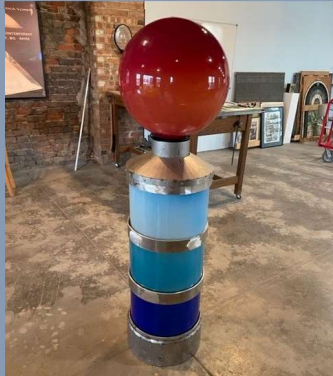
Glass tower model in studio