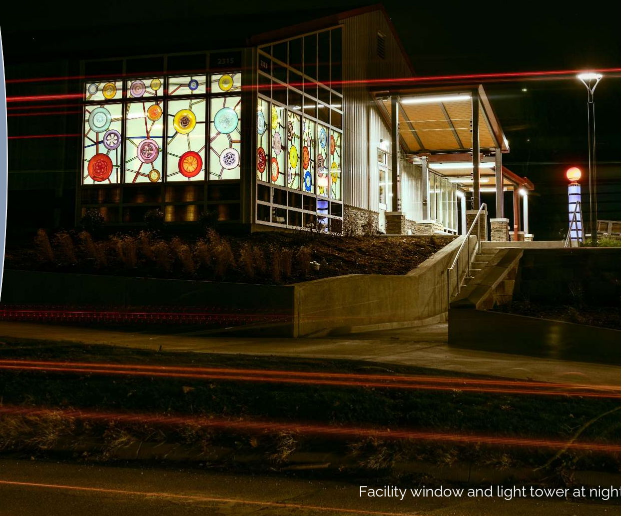
Facility window and light tower at night