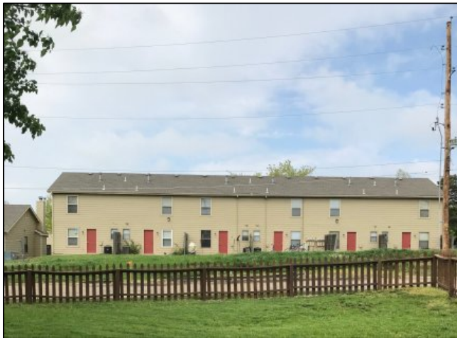
Here is a backside view of The Villa townhomes on 3800 Clinton Parkway. There are six patio slabs and six AC units. The Elkins concept plan submitted has nine patio slabs and nine AC units and almost no setback facing neighbors on Dakota Street. The city would be expecting Parkhill property owners to accept drastically lower property values and a drastically lower quality of life if the Elkins property is rezoned. And the RM-12 zoning offers no protection.

I suggest that the city keep the Single Dwelling zone, but allow a variance like townhomes that are compatible with the neighborhood and with appropriate guidelines for setback, density, and home ownership. The map above illustrates the extreme difference in density of the Elkins concept plan offers. Even the auto parts store has a larger buffer. The submitted plan is not compatible with the surrounding area. The city needs more affordable housing, but the city must also maintain the stability of its existing neighborhoods.