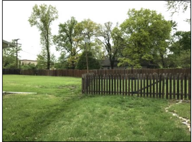
The view at right is a slightly different angle showing O'Reilly's Auto Parts on the left.