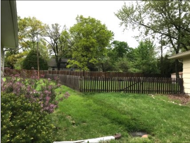
At left is the view of the Elkins property at 2314 Tennessee Street from between the abutting properties, 314 and 308 Dakota Street, taken Wednesday, May 1. One of the Elkins' houses is barely visible.