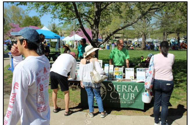
Left: Lawrence Drives Electric hosted a pop-up car show after participating in the Earth Day Parade. Right: The Sierra Club, which is the oldest grassroots environmental group in the United States, provides information and an origami butterfly activity.