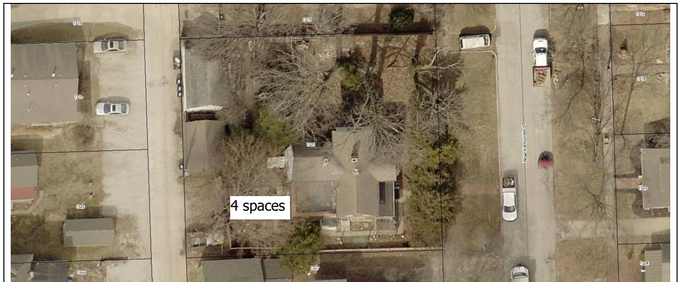
4 parking spaces accessed off the alley.

Per Section 20-902-Schedule A of the Land Development Code, the parking requirement for the non-owner occupied Short-Term Rental use is 1 vehicle space per guest room. The owner indicated that the maximum number of guest rooms available to rent is 4. The number of off-street parking is 4 spaces, 3 surface and 1 garage space. The amount of available off-street parking meets the off-street parking requirement.