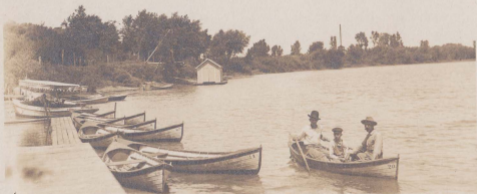
50. Boats on the Kaw.