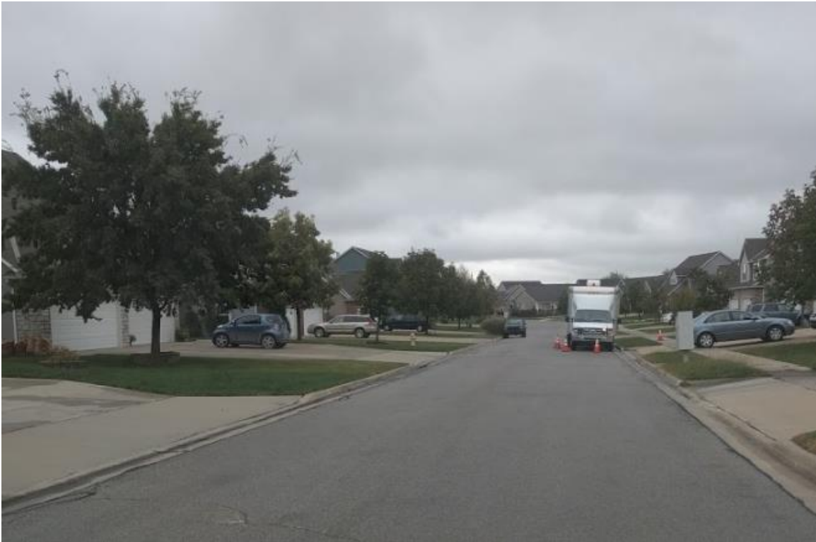
From 23 rd Terrace facing North (Tuesday at 3:30 PM)