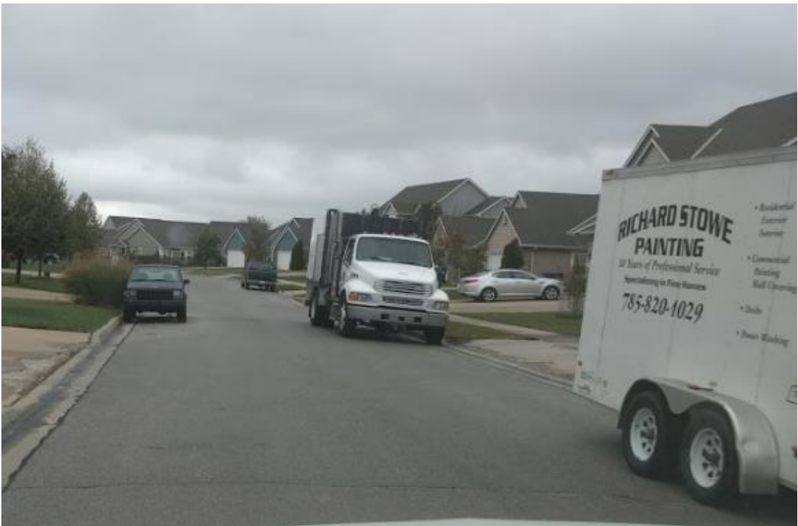
Between 23 rd Terrace and 24 th Terrace facing North

No Parking Request – Surrey Drive from 25 th Terrace to 23 rd Terrace