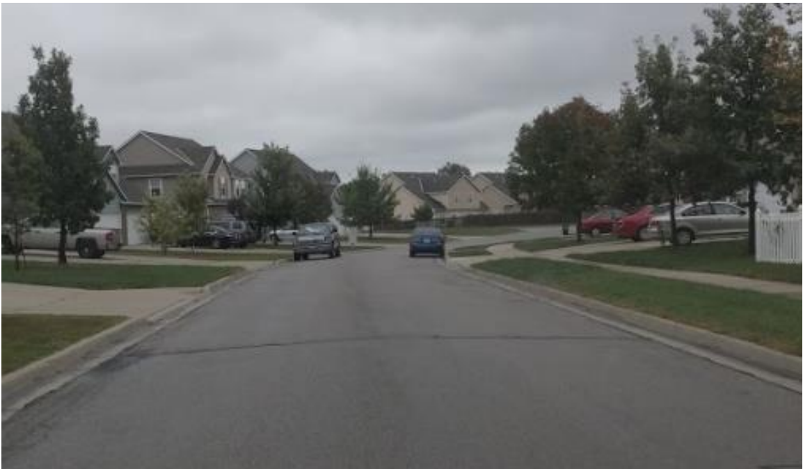
Between 24 th Terrace and 25 th Terrace facing North

No Parking Request – Surrey Drive from 25 th Terrace to 23 rd Terrace