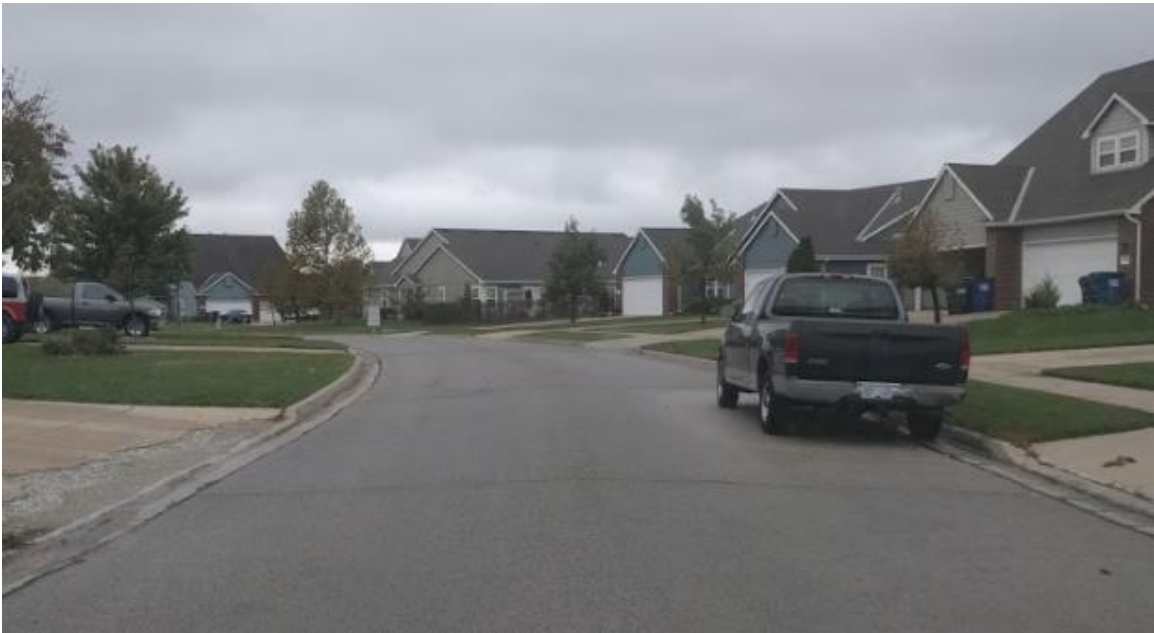
From 24 th Terrace facing North