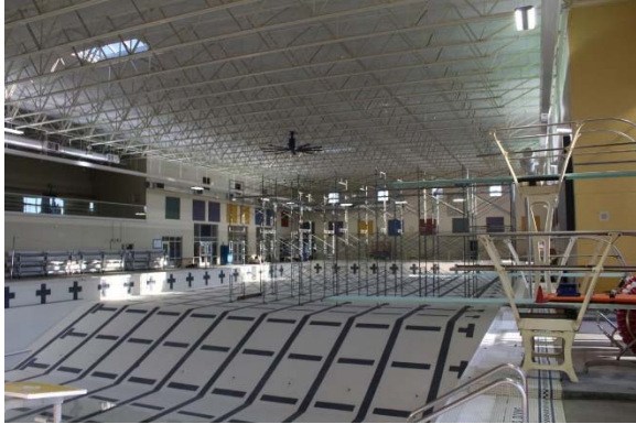
Ductwork at Indoor Aquatic Center.