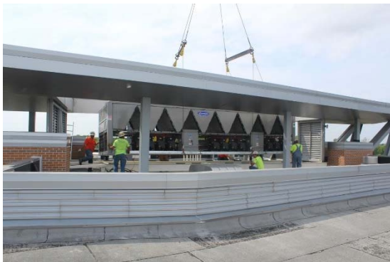
New chiller at Community Health.

Below are some progress photos that show key projects that took place over the summer.