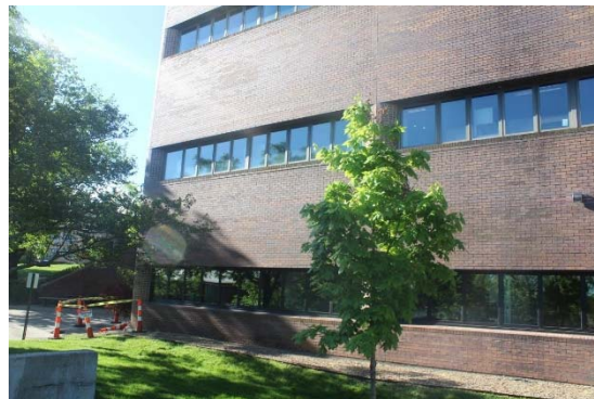
New windows at City Hall.