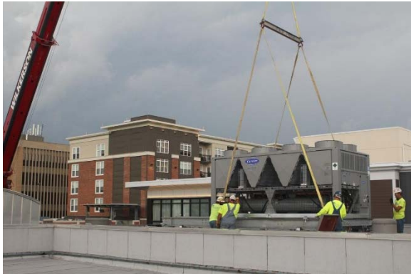
New chiller at Arts Center.