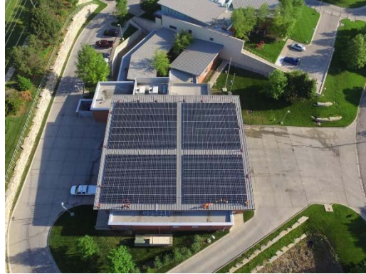
Fire/Med 5 Solar PV array.