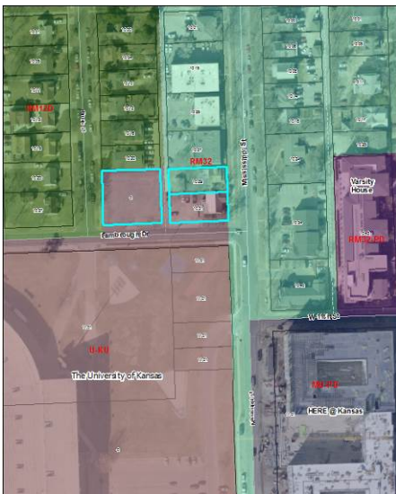
Figure 1: Surrounding Zoning and Land Use

Surrounding land uses include detached dwellings, duplex, triplex, and multi-dwelling buildings with 4-24 units north of Fambrough Drive and University related uses on the south side of Fambrough Drive. The Kansas football stadium is located south of the subject property.