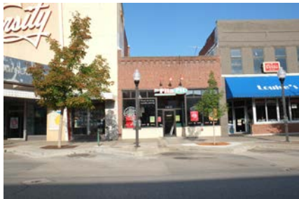
1011 Massachusetts Street

In accordance with the Secretary of the Interior's Standards , the standards of evaluation for the State Law Review, staff administratively approved the project and made the determination that the project does not damage or destroy any historic property included in the National Register of Historic Places or the State Register of Historic Places (Register of Historic Kansas Places).