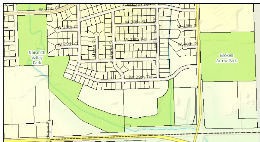
Figure 3: Existing Parks

The property has been acknowledged through the years as suitable for future infill development. The Revised Southern Development Plan designated the specific use as to medium density residential. The proposed request does not alter that land use recommendation. The area to the south has been incorporated into the City's park inventory and Naismith Park has been extended to the south and east with the 2013 annexation and zoning considerations.