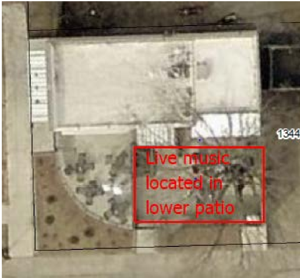
Figure 1. Aerial of Bullwinkles showing location of live music