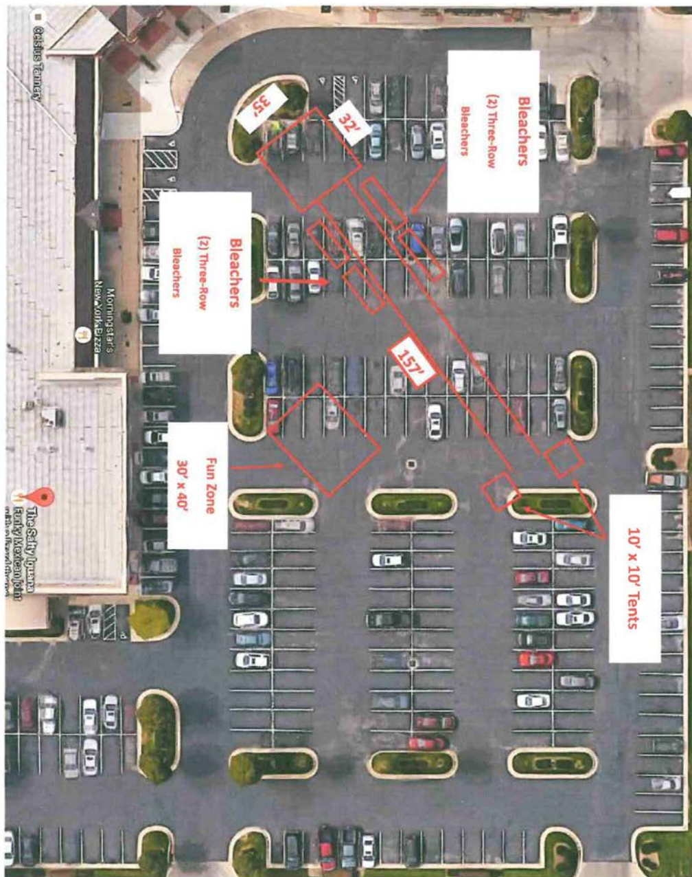
Plan B – Based on Wind Direction