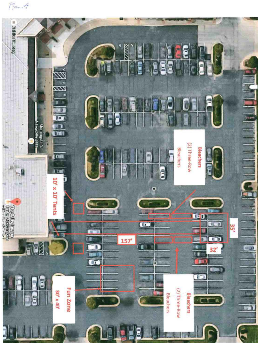
Plan A – Preferred – Based on Wind Direction