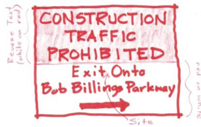
Signs viewed from Langston Hts., entering Diamondhead (2 ea.)

These signs were ordered on Friday, April 17 and will be installed on Tuesday, April 21 or thereabouts.