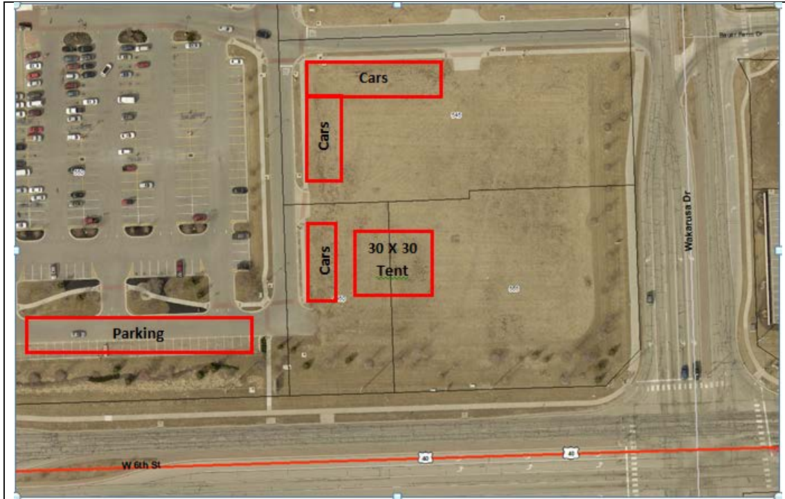
Figure 1. Event location showing the location of cars for sale, tent, and vehicle parking.