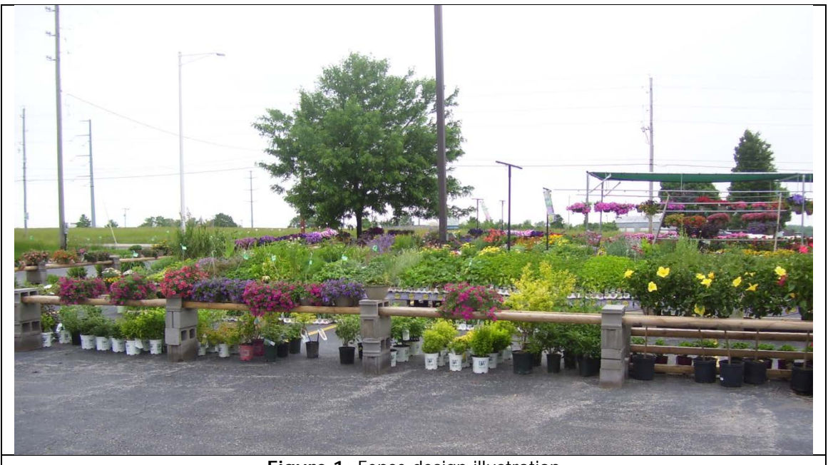
Figure 1: Fence design illustration