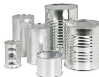
Tin and Steel Cans