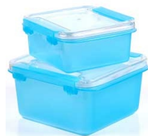
Plastic Tubs and Jars