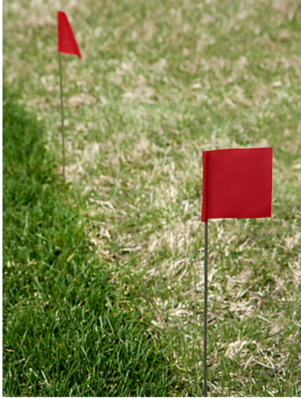
Flag height 21" length 2 ½" x width 3 1/2"