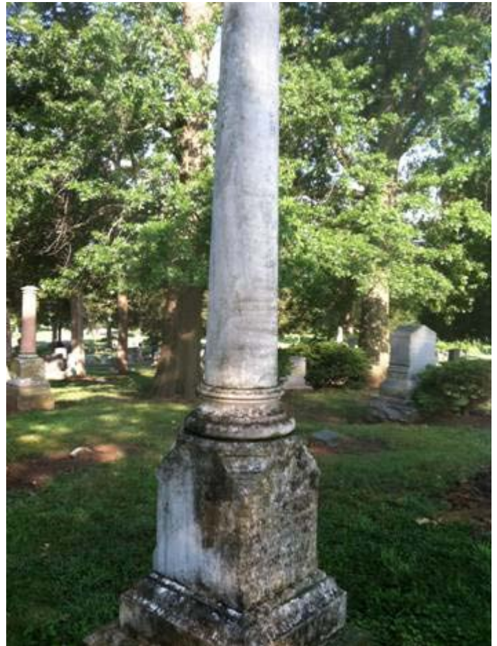
Pictures show before the power wash (left) and after the wash (right).