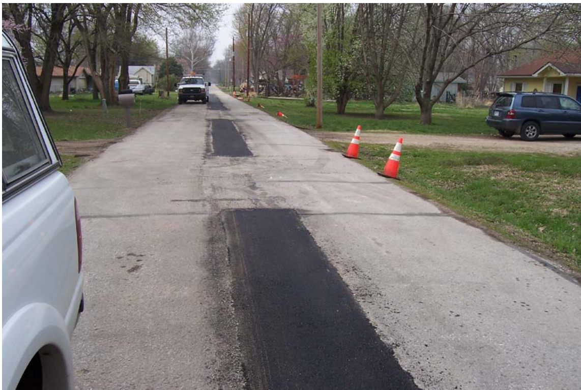
Description – Contracted Patching in north Lawrence in preparation for Microsurfacing