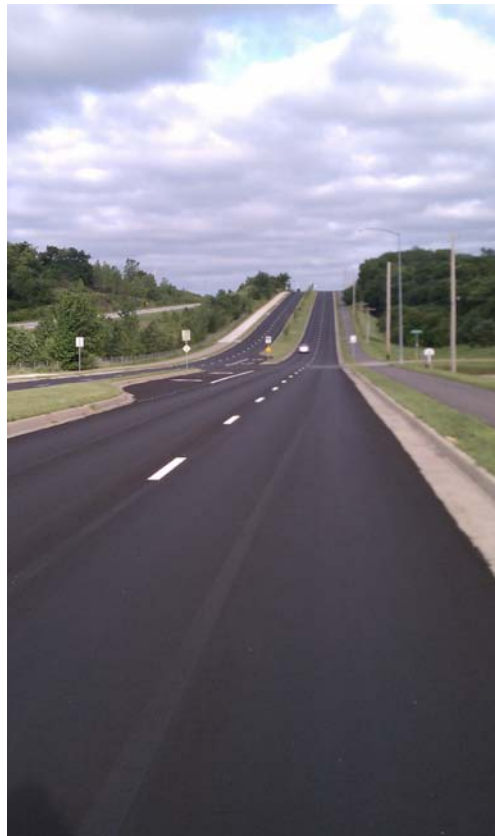
Description – Contracted Microsurfacing/Patching w/ Pavement Markings on Clinton Parkway west of Wakarusa Dr