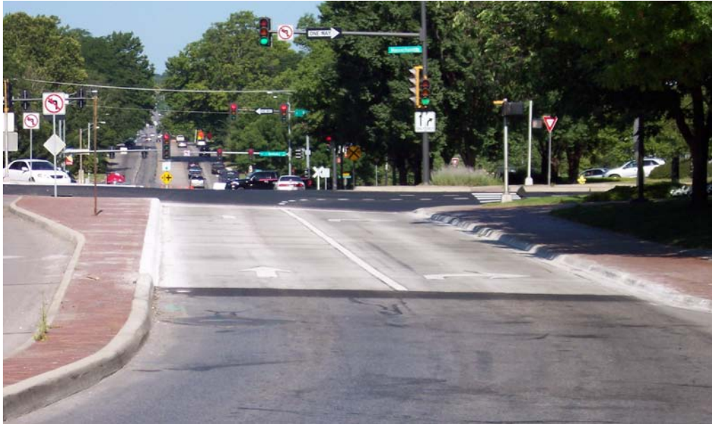
Description – Contracted Concrete Reconstruction east of E 6 th St & Massachusetts St