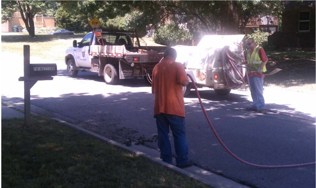
Description – Crack Sealing performed by Internal Street Maintenance Division (photo of cracks & joints being cleaned out prior to sealing)