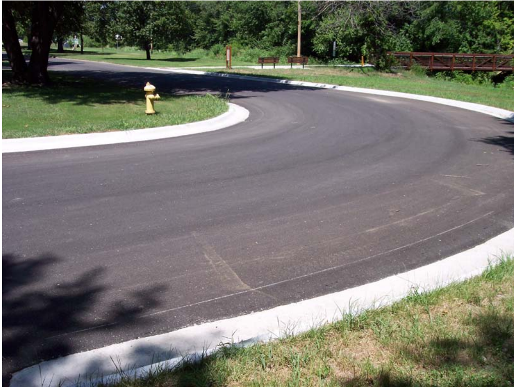
Description - Contracted Milling & Overlay on Forrest Ave at Maryland St with coordinated Concrete Curb Replacement work performed by Internal Street Division