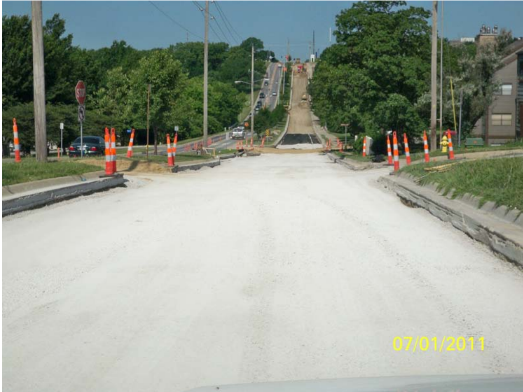
Description – Contracted Reconstruction of westbound driving lanes of Bob Billings Parkway east of Kasold Dr during Pavement Removal and Subgrade Preparation & Treatment