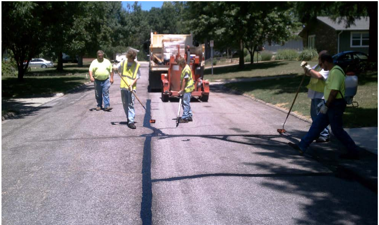
Description – Crack Sealing performed by Internal Street Maintenance Division