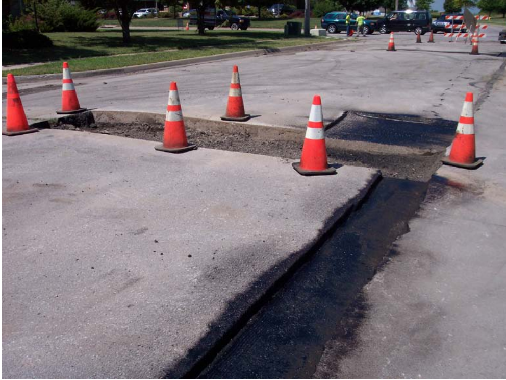
Description – Contracted Patching preparation for Microsurfacing on W 18 th St at Carmel Dr