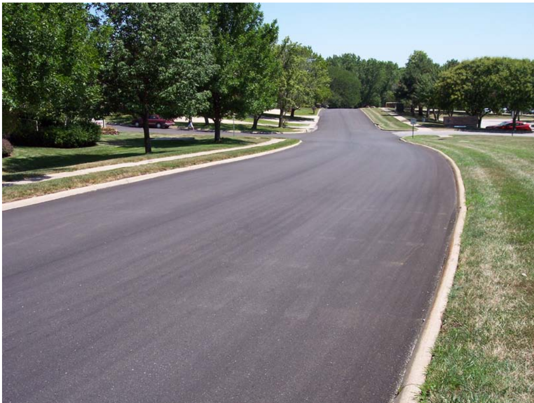
Description - Contracted Milling & Overlay on St Andrews Dr at Seminole Dr