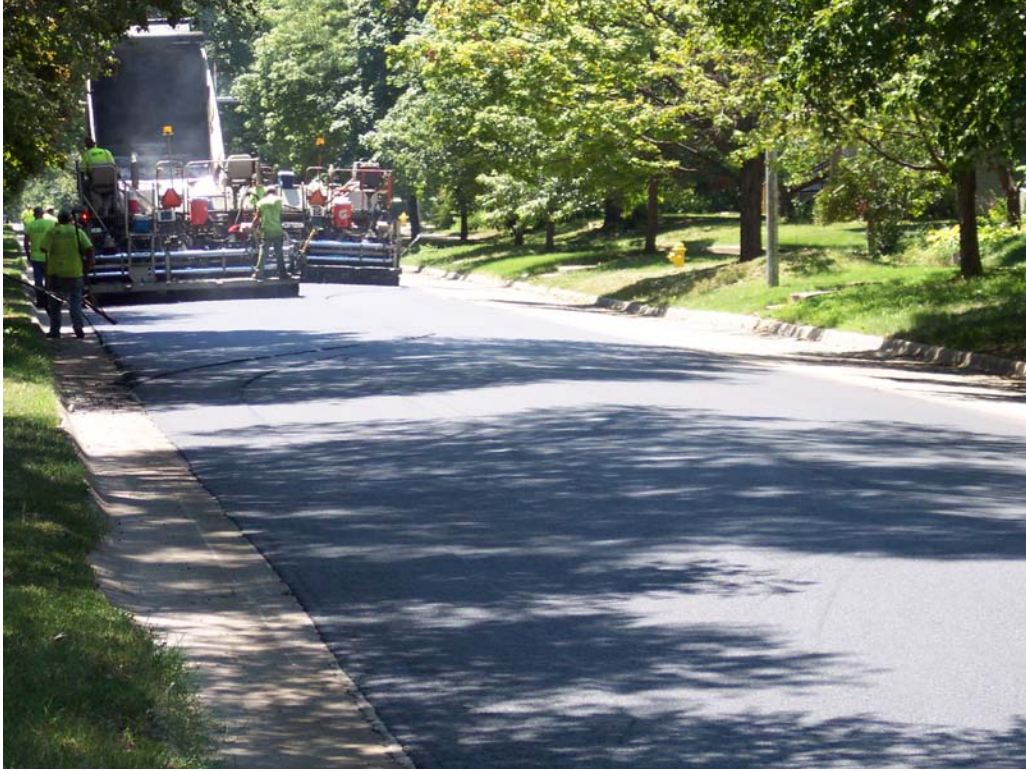
Description - Contracted Milling & Overlay on Tennessee St from W 9 th St to W 19 th St