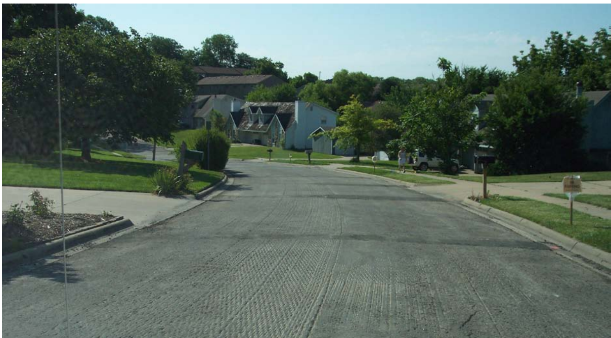
Description - Contracted Milling and Patching on Oxford Rd to University Dr prior to Overlay