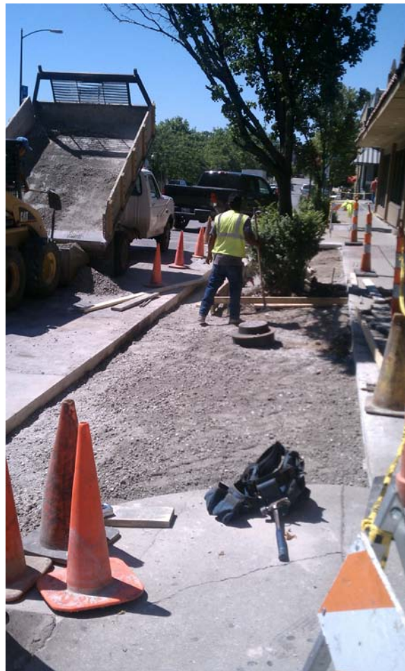
Description – Contracted Concrete Curb & Gutter Repair with Concrete Pavement Patching in Downtown Lawrence (left picture - prior to work, right picture - during removal/replacement)