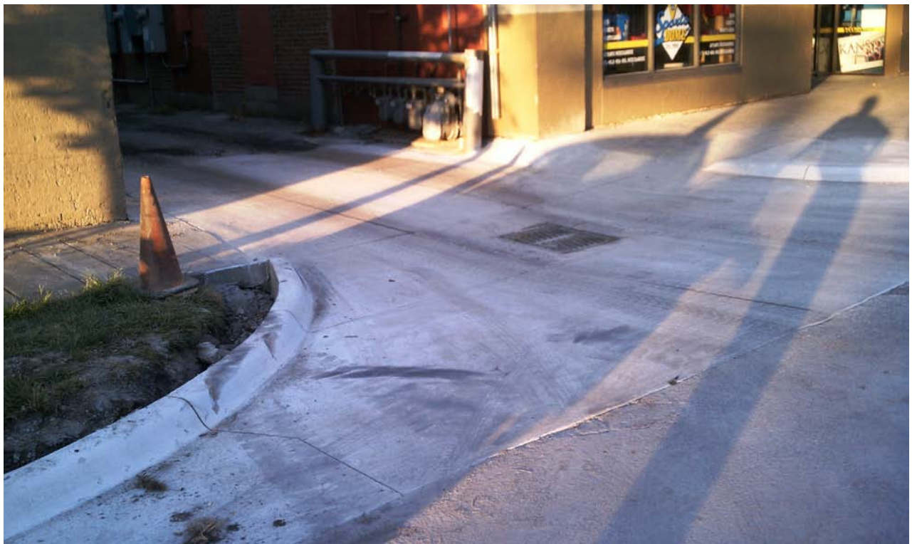
Description – Contracted Concrete Curb & Gutter Repair along with Concrete Pavement Patching in Downtown Lawrence (above - prior to work, below – removal/replacement completed)