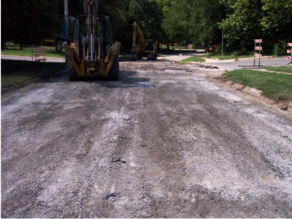
Description – Contracted Concrete Reconstruction of Crestline Dr from south of Orchard Ln to Westdale Rd which includes Underdrain System installation (photo during pavement removal)