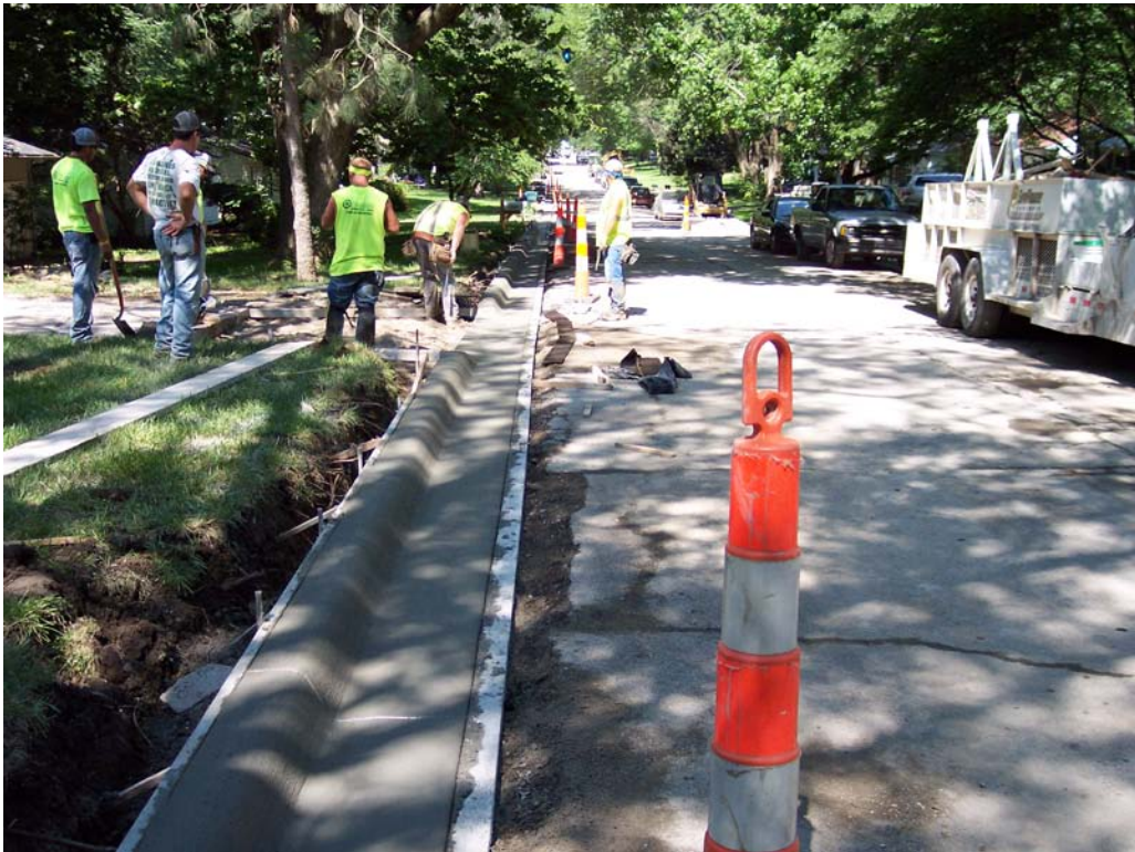
Description – Contracted Concrete Curb & Gutter work prior to Milling & Overlay on W 22 nd St between Ousdahl Rd & Naismith Dr