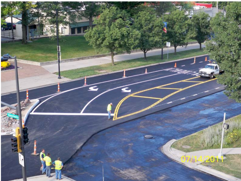
Description – Contracted Milling & Overlay (KLINK) of E 6 th St at Massachusetts St (photo taken during overlay and restriping)