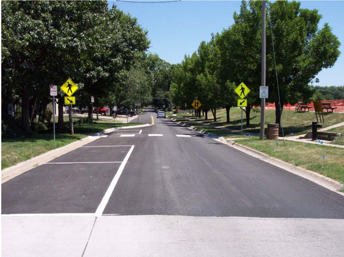
Description – Contracted Microsurfacing/Patching w/ Pavement Markings on Elm St east of N 2 nd St