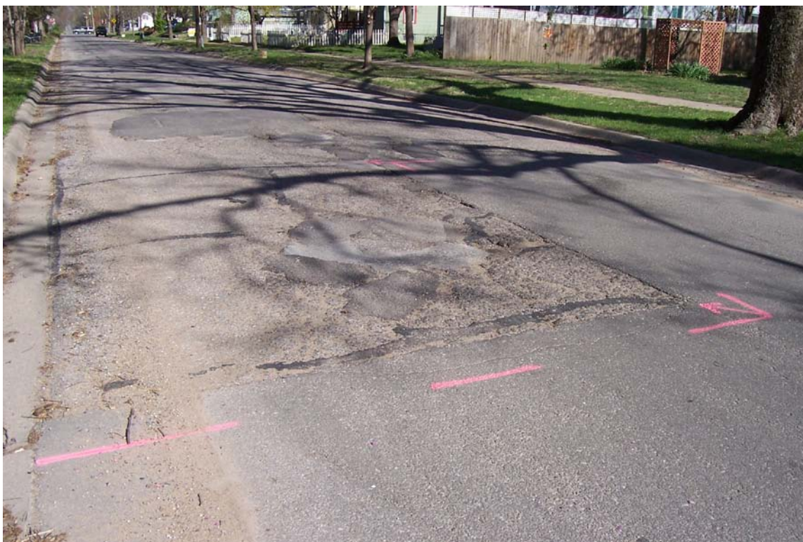
Description – Area marked for Contracted Patching in north Lawrence prior to Microsurfacing