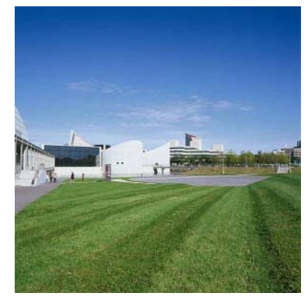
Fire lane can also be used as an event access drive. Notice the hard-surfaced plaza in the background, the edge of which is also shown in the above photo.