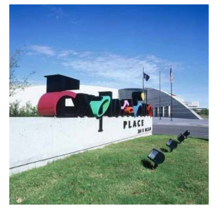
Multicolored signage marks the entrance. Our fire lane is located around the backside of the vertical curved wall to the right.