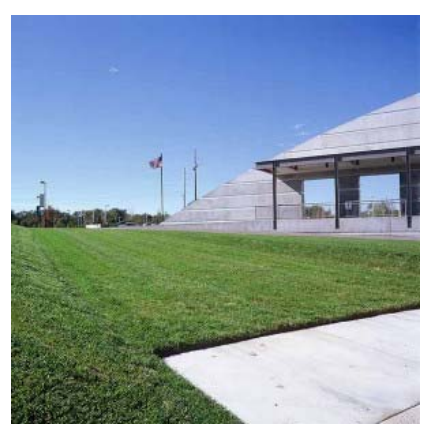
View from far side of curved wall, the fire lane is nicely marked with a slope on the left.