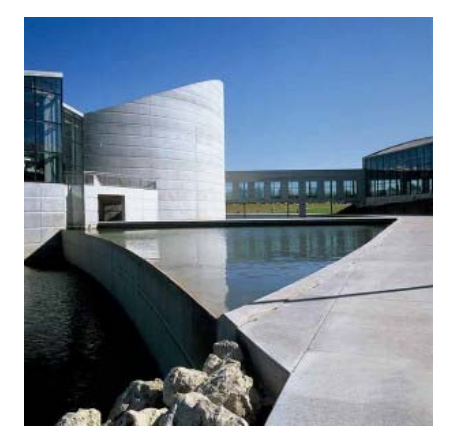
Architecture view showing river level on left, moat, pedestrian river trail. and overhead walkwav