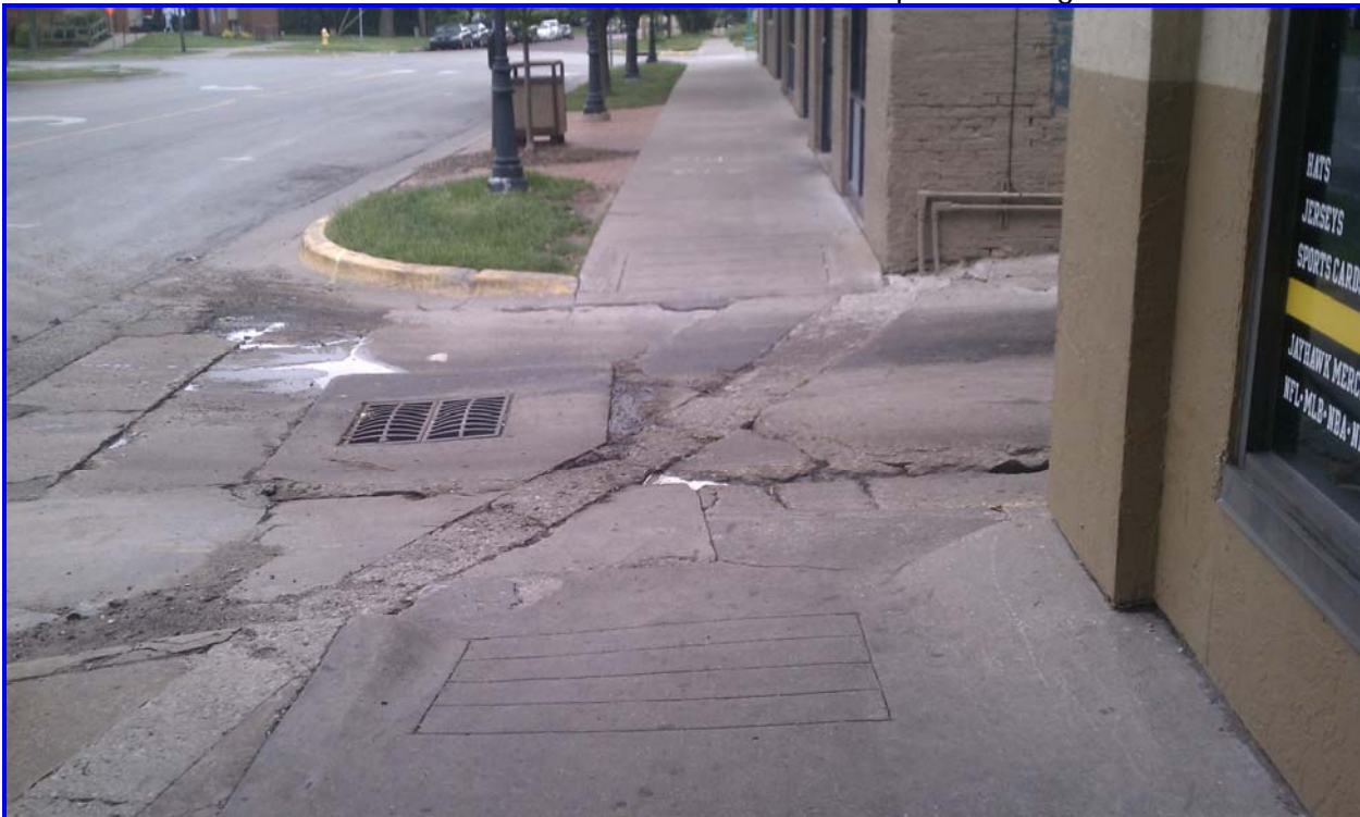
Downtown Concrete Rehabilitation - Before