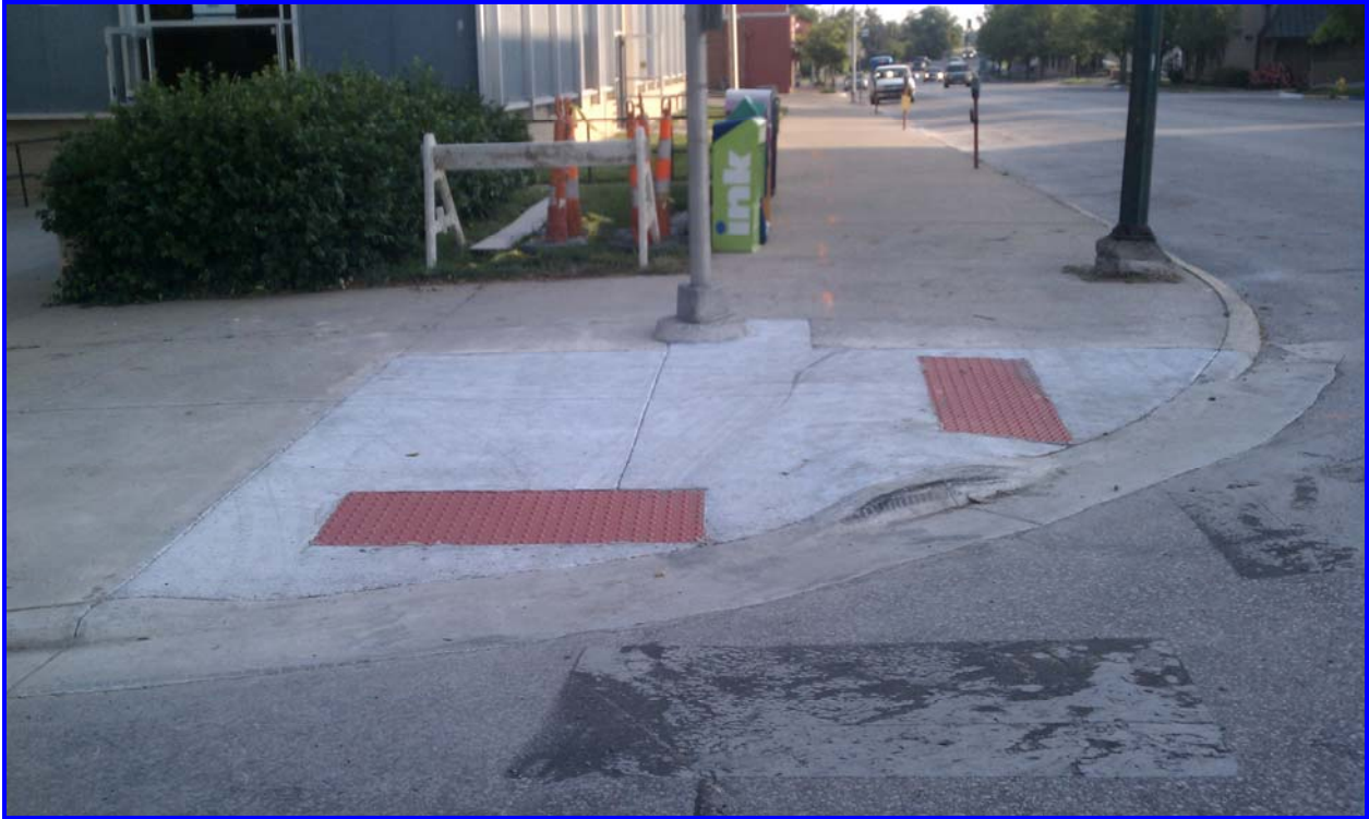
Downtown Concrete Rehabilitation - After