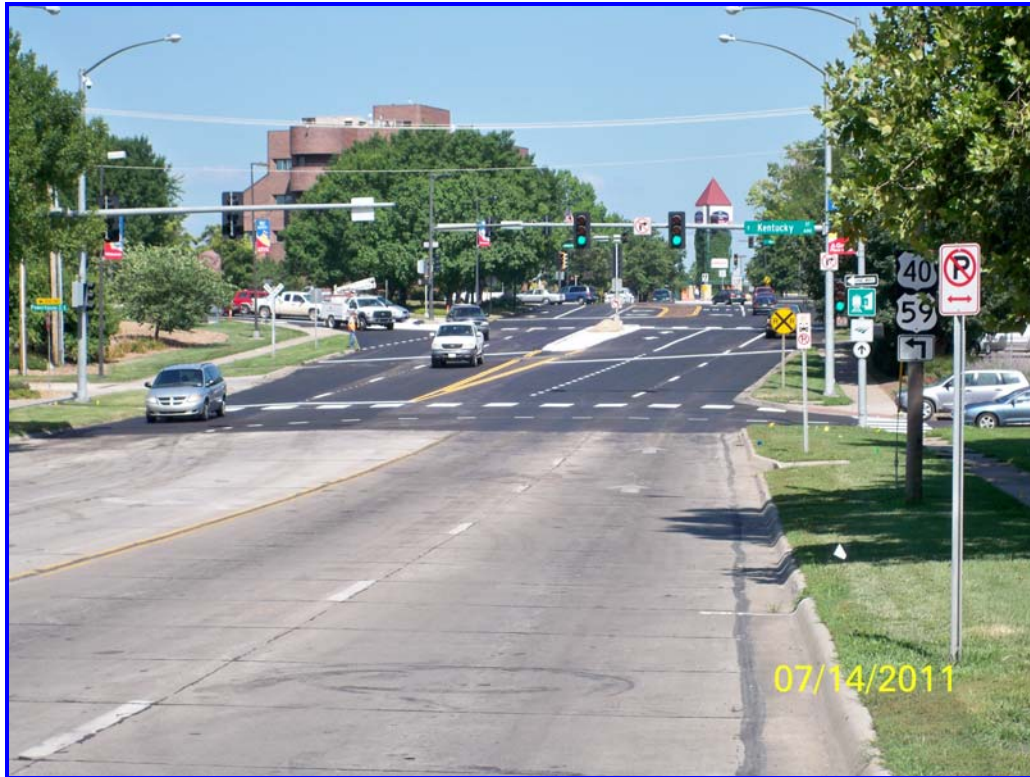
6 th St. – looking East