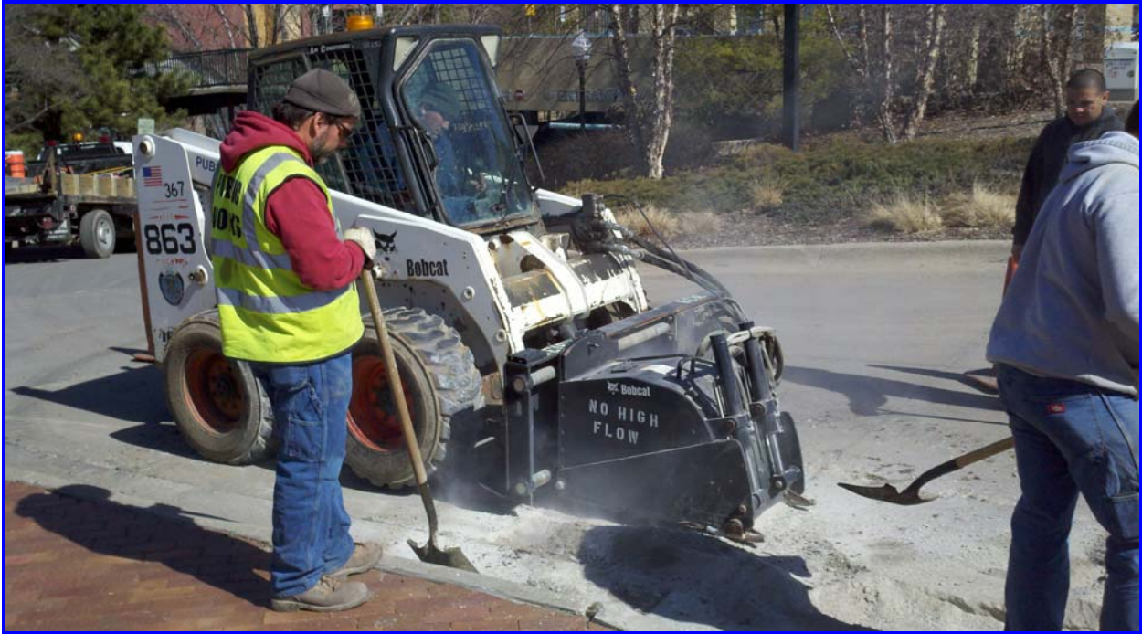
Downtown Concrete Rehabilitation Curb Repair - During