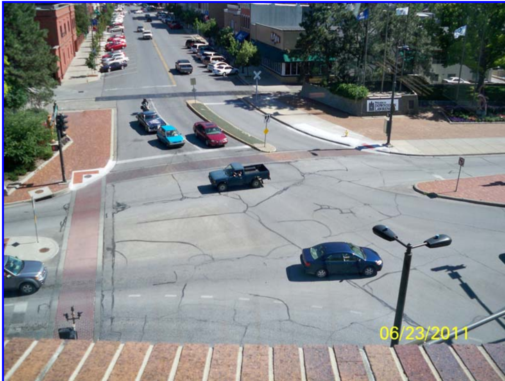
6th & Massachusetts before – looking south