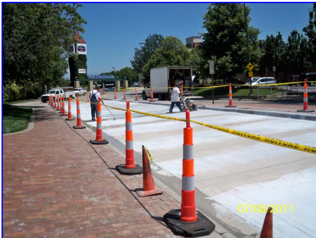
6 th St. concrete repairs to the approach at Massachusetts St.