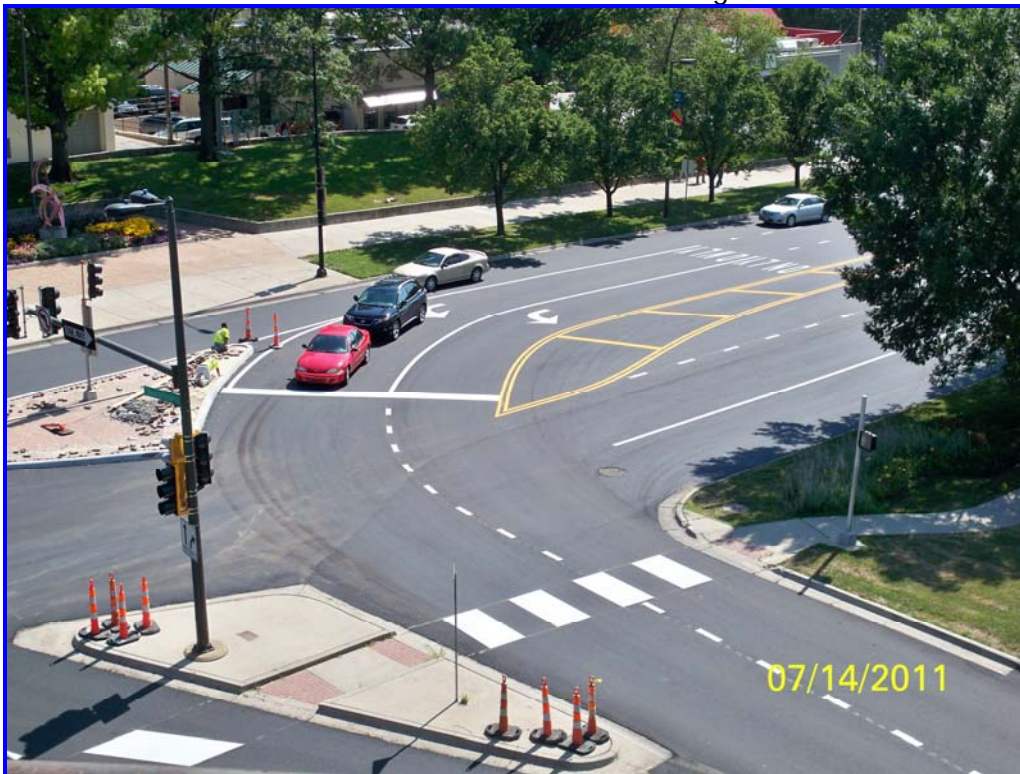
6 th & Massachusetts after – looking SW