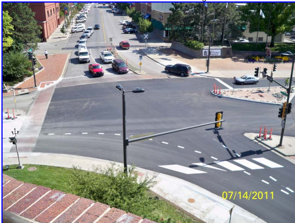
6 th & Massachusetts after – looking south