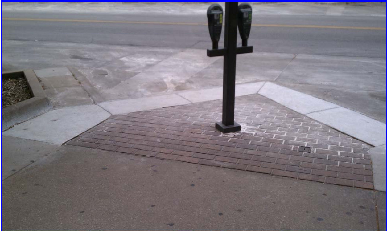
Downtown Concrete Rehabilitation - After