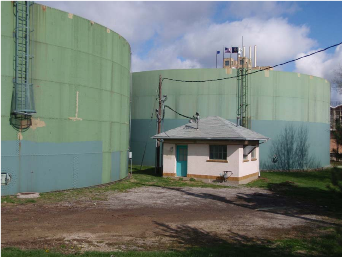
Oread Tanks and Pump Station