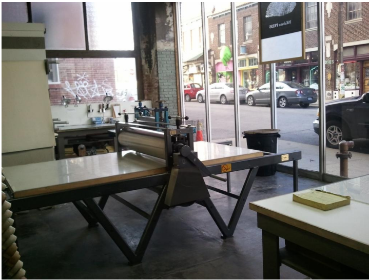
Print shop- equipment was purchased last year from grants