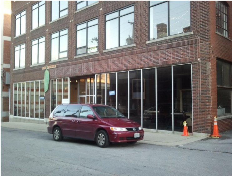
Exterior of the Kansas City Arts Incubator