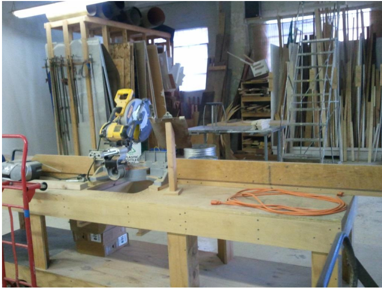
The wood shop. The incubator contains a wood shop, print shop, metal works, studio space, a gallery, and an events area on the top floor.