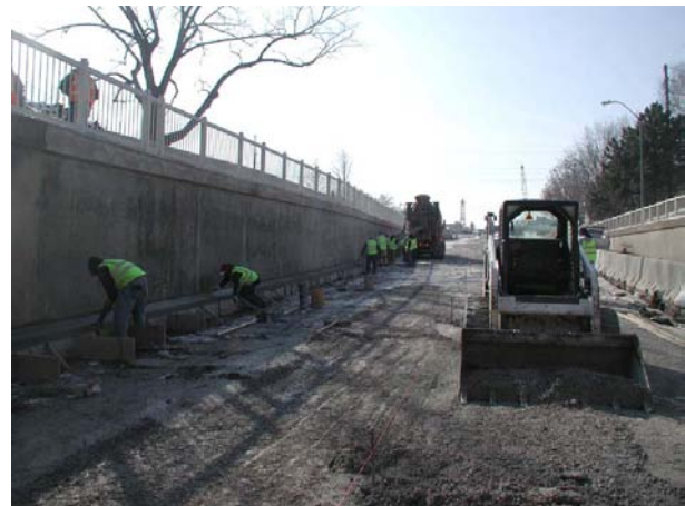
ARRA and KDOT funding provided resources for a key gateway intersection improvement into downtown Lawrence in 2009-2010.