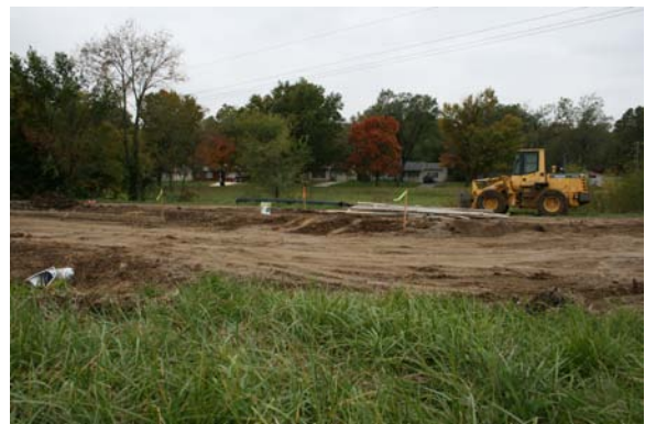
City of Lawrence rail-to-trail project financed with a KDOT transportation enhancement grant and City sales tax revenues.

Sales taxes are a vital component of City budgets funding essential municipal services and capital improvements. An important federal and state issue that must be addressed is the legal authority to impose state, city, and county sales taxes on electronic commerce and catalog sales. A sales tax on e-commerce and catalog sales protects an important revenue source for state and local governments and puts traditional land based businesses in our communities on an equal taxation footing with their electronic competitors. The Kansas Legislature should continue to pursue the "Stream-lined Sales Tax" efforts and other opportunities to include Internet and catalog sales tax collection.