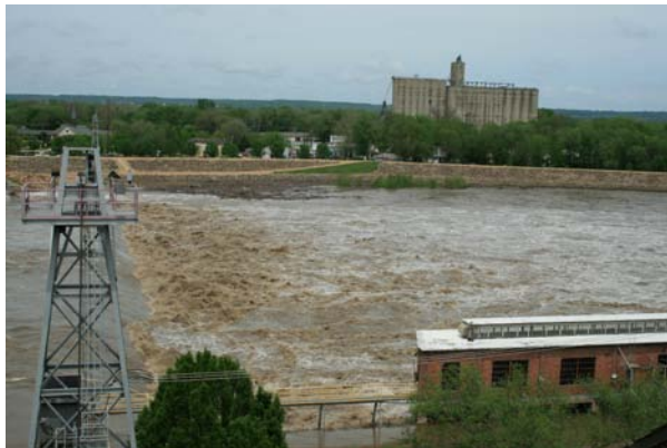
Maintenance of the Bowersock Dam on the Kansas River is also key to Lawrence's water supply.