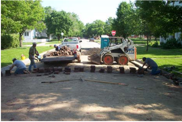
A KDOT Transportation Enhancement Grant provided funding for the restoration of a brick street in an historic neighborhood.