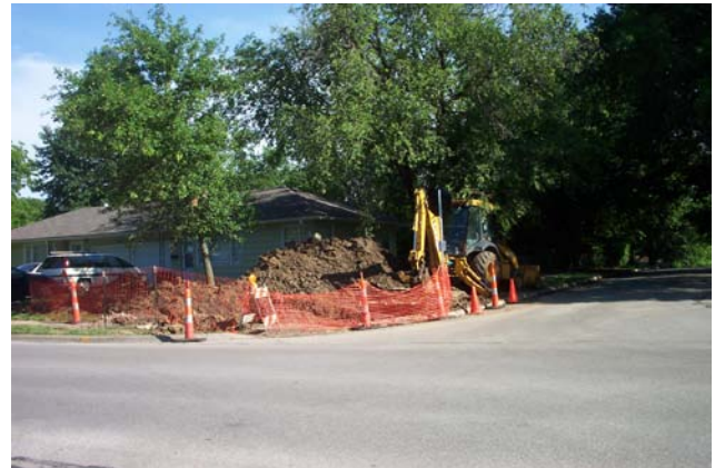
Cities must be able to regulate utility companies that use the public right of way.