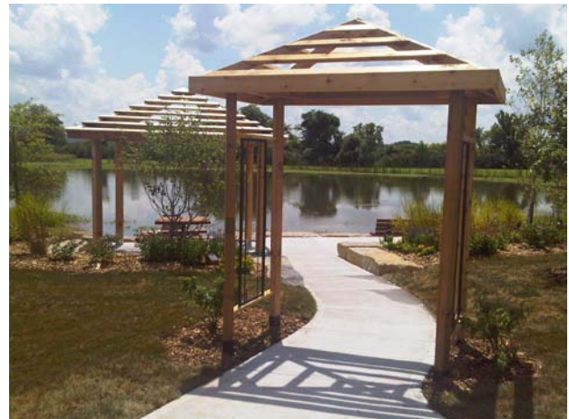
This project at the Rotary Arboretum park was made possible through a donation. The Legislature should consider additional incentives for charitable contributions to municipalities.