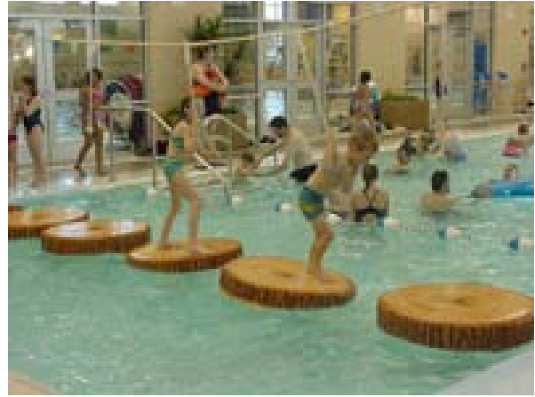
Cuts to alcohol and liquor tax revenue will mean cuts to vital community programming for youth.

The City of Lawrence and many community groups rely heavily on monies received from State taxes levied on alcohol purchases. Pursuant to State law, one-third of the fund revenues are allocated to the City's General Fund, one-third to the Special Recreation Fund and one-third goes in the City's Special Alcohol Fund. Resources in the City's general fund provide support for a number of City services, while monies deposited in the City's Recreation Fund provides resources for a number of park and recreation activities. A number of not-for-profit Lawrence organizations and our school resource officers rely on the funds from the City's Special Alcohol Fund for their programs. These programs and services are vital to the health of the Lawrence community. The City of Lawrence opposes any efforts to divert or diminish the distribution of local alcohol tax fund dollars to the state. The City supports the addition of local alcohol and liquor taxation authority.