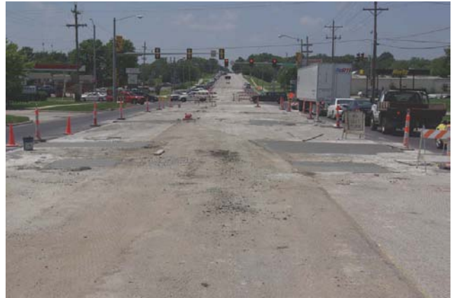
Project funding for improvements to 23 rd Street were provided by Kansas Department of Transportation KLINK funds and the City of Lawrence.