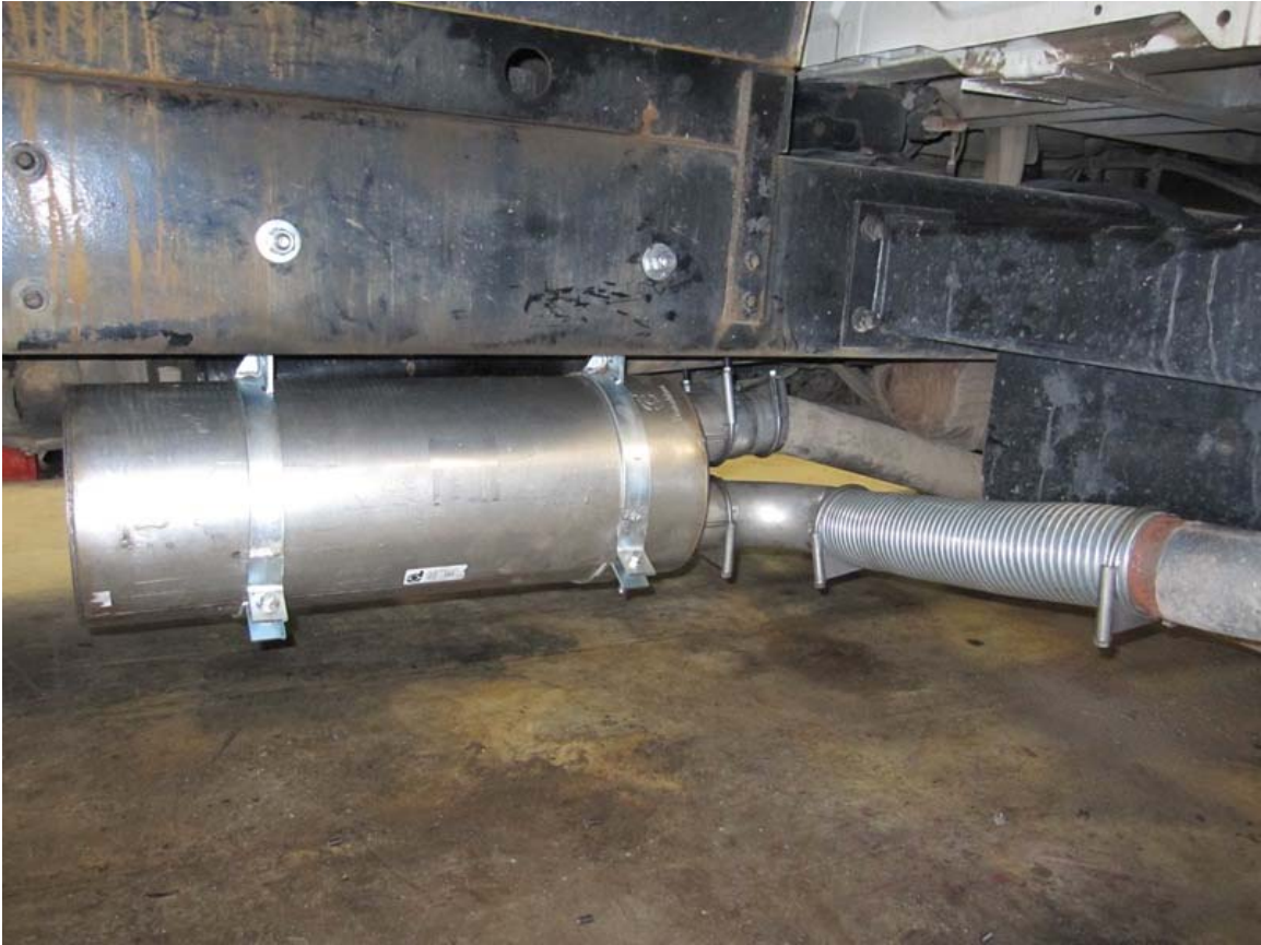
Diesel Oxidation Catalyst