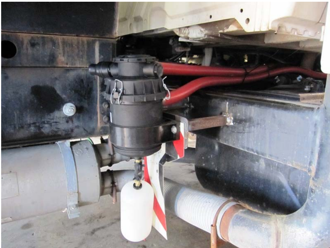
Closed Crankcase Vent System