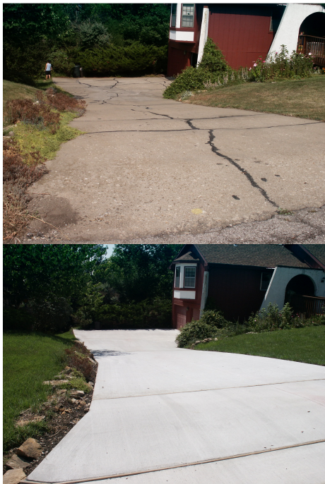
Before (left) & After (right) photo of a driveway project done through the Comprehensive Housing Rehabilitation Program.