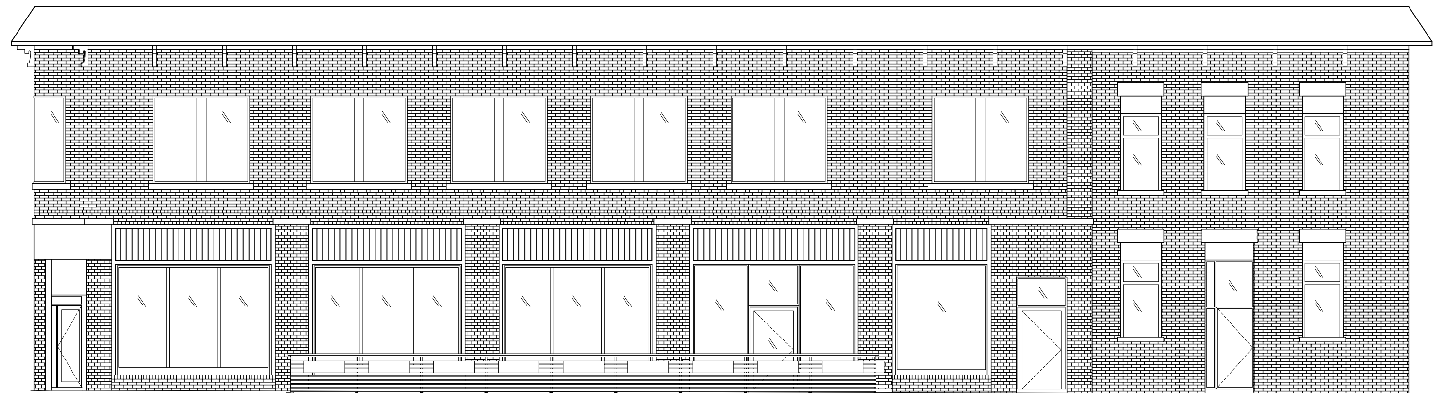
NORTH ELEVATION SCALE: 1/8" = 1'-0"