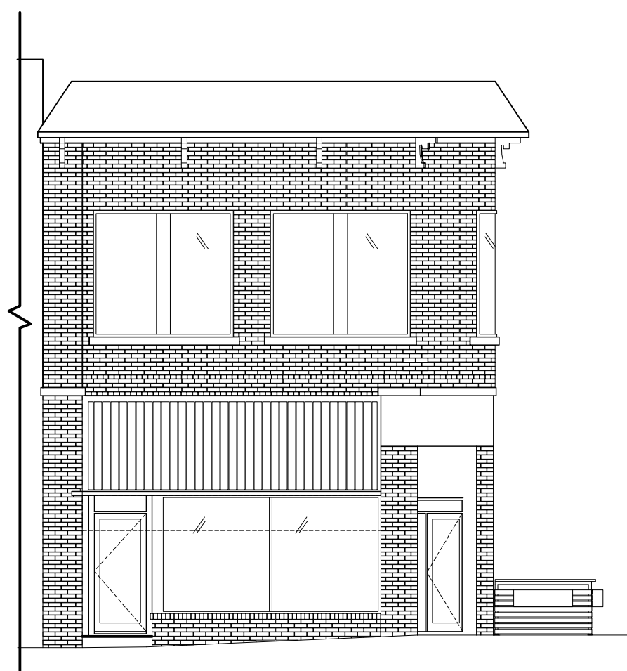
EAST ELEVATION SCALE: 1/8" = 1'-0"