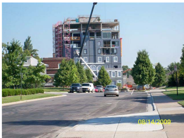
City Street improvements financed through the 12 th Street and Oread Tax Increment Finance District

The City encourages the Legislature to preserve funding for essential municipal services. The City urges the restoration of demand transfer payments to local governments. Revenue sharing programs between the state and municipalities are better tools for providing property tax relief than artificial remedies – like caps on local mil levy increases. The legislature should not prohibit local measures to raise revenue such as development excise taxes or the establishment of tax increment finance districts or transportation development districts. Cities need flexibility in responding to local budgetary and fiscal needs.