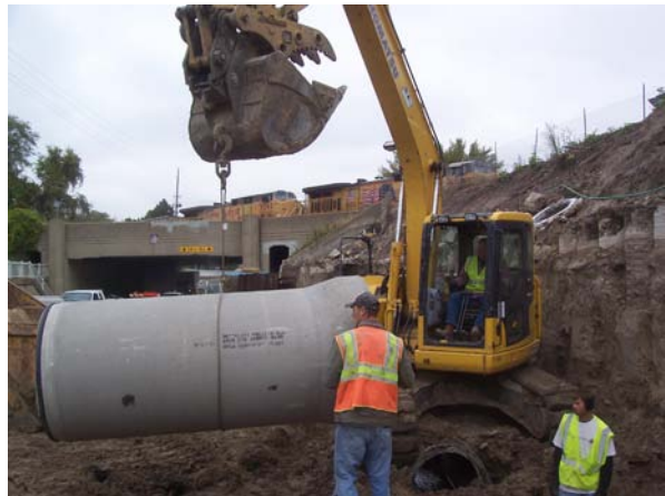
Intersection improvements at 2 nd Street and Locust funded through the American Recovery and Reinvestment Act.