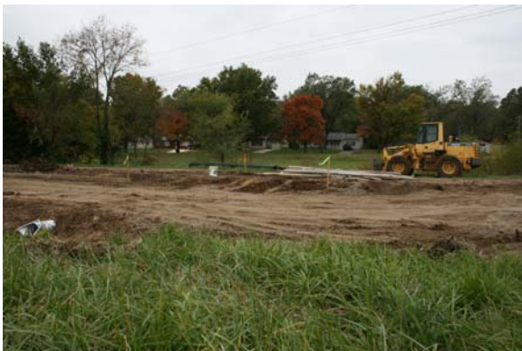
City of Lawrence rail-to-trail project financed with a KDOT transportation enhancement grant and City sales tax revenues.

Sales taxes are an increasingly important component of City budgets, funding essential municipal services and capital improvements which benefit our entire community. An important federal and state issue that must be addressed is the legal authority to impose state, city, and county sales taxes on electronic commerce and catalog sales. A sales tax on e-commerce and catalog sales protects an important revenue source for state and local governments and puts traditional land based businesses in our communities on an equal taxation footing with their electronic competitors. The Kansas Legislature should continue to pursue the "Stream-lined Sales Tax" efforts and other opportunities to include Internet and catalog sales tax collection.