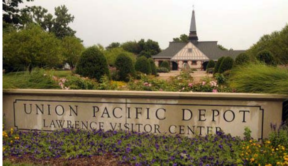
The City of Lawrence is part of the federally designated Freedom Frontier's National Heritage Area

The City of Lawrence offers many destination places for travel and entertainment. The City encourages the State of Kansas to enact a comprehensive tourism plan and to increase state funding of tourism promotion and marketing.