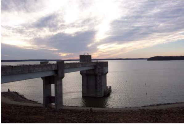
Clinton Reservoir is vital to Lawrence's water supply