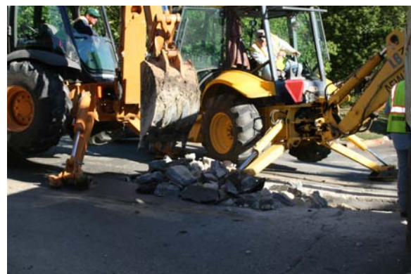
Lawrence must be able to regulate utilities that use public right of way.

Lawrence's ability to franchise utility companies and regulate its public rights-of-way must not be compromised. Private companies which use a public asset – such as locally owned right-of-way – should continue to be required to collect franchise fees. These utilities should also continue to be required to relocate in the right-of-way for public projects at their own expense – and not at the expense of local taxpayers.