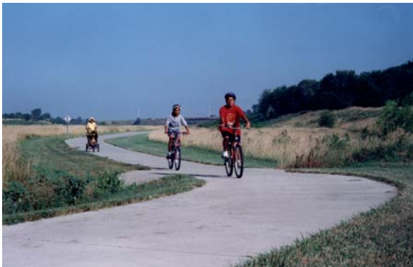
The special alcohol fund revenue supports many recreation opportunities in Lawrence.