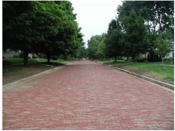
The restoration of this brick street in Old West Lawrence was made possible in part through a transportation enhancement grant through the Kansas Department of Transportation.