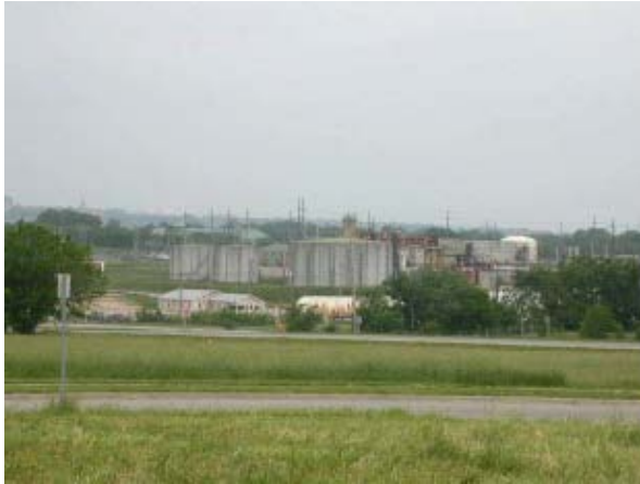
In 2009, the City of Lawrence initiated and annexed 450 acres of the former Farmland Industries property adjacent to the Lawrence City limits.

In the 2009 session, legislation was again introduced that would have severely limited the authority of the City to annex new property. The City of Lawrence opposes efforts to limit the ability of cities to annex. We oppose changes to the current state annexation statutes. Annexation provides a key tool for municipal ability to manage and plan for growth.