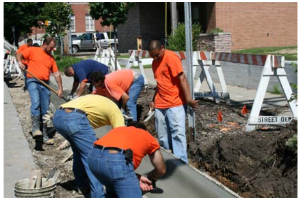
The State Motor Fuel Tax Revenue provides an important funding source for infrastructure maintenance.