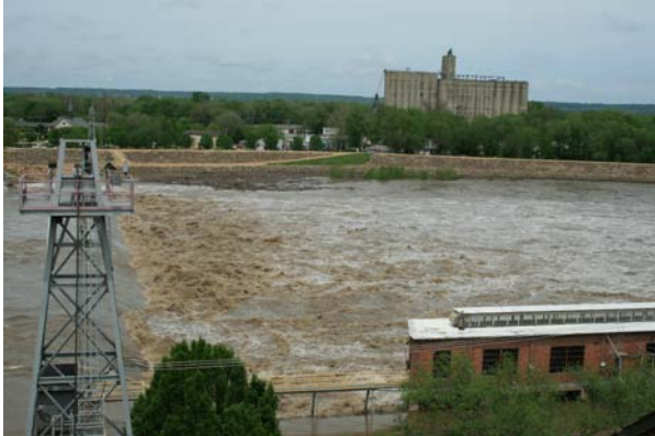
Maintenance of the Bowersock Dam on the Kansas River is also key to Lawrence's water supply.